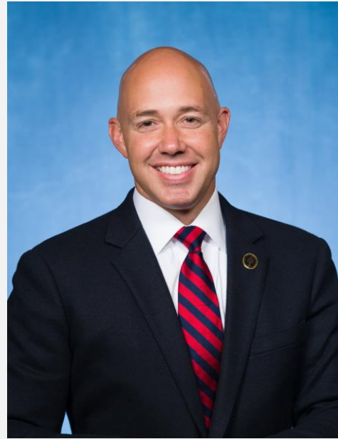
U.S. Congressman Brian Mast of House District 21