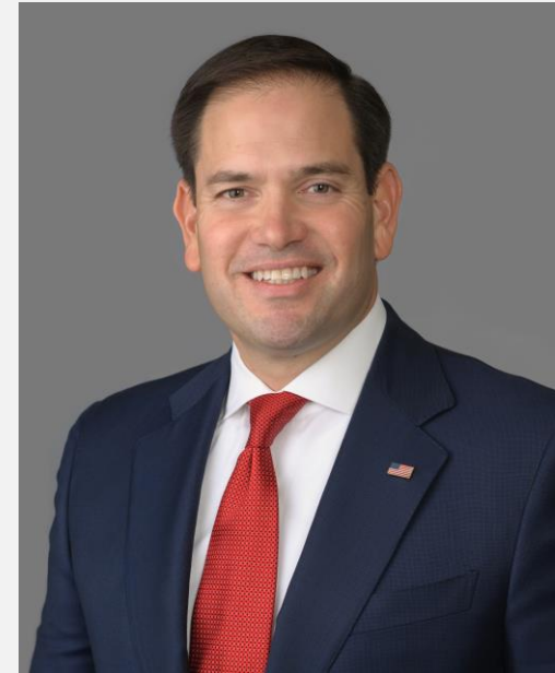
*U.S. Senator Marco Rubio

CITY OF PORT ST. LUCIE FEDERAL DELEGATION