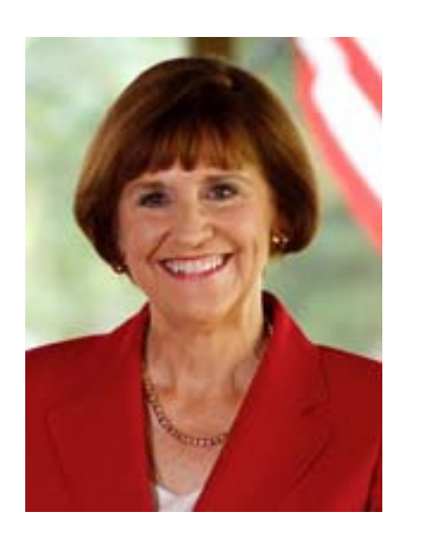
State Senator Gayle Harrell