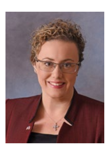
State Senator Erin Grall