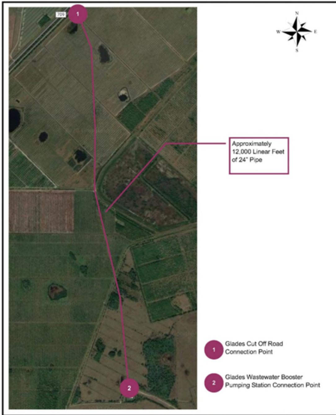
Figure 1. Project location and proposed pipeline route