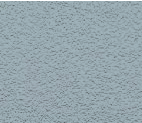
ACCENT COLOR SW 760I W/ TEX-COTE FINISH “DOCKSIDE BLUE”