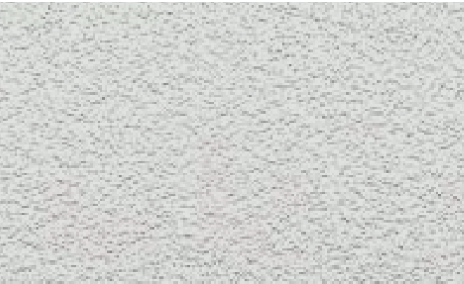
PRIMARY COLOR SW 962I W/ TEX-COTE FINISH “CLEAN SLATE”