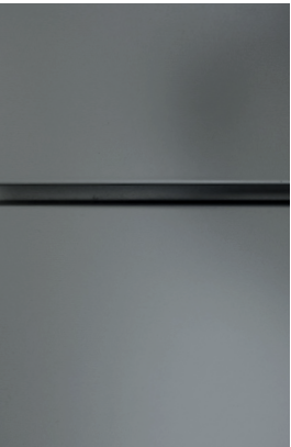
METAL CANOPIES DREXEL® “ZINC”