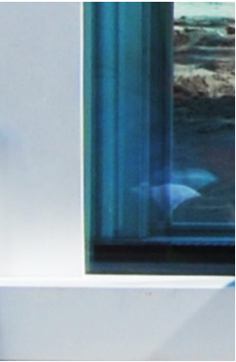
MULLION FINISH / TRIM ANODIZED ALUMINUM