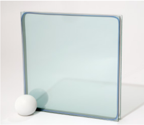
GLAZING VITRO® “SOLAR BAN RIOO CLEAR” W/ LOW-E COATING