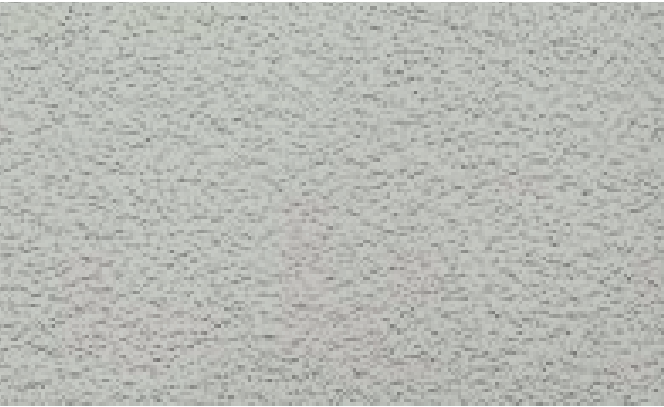
PRIMARY COLOR SW 7657 W/ TEX-COTE FINISH “TINSMITH”