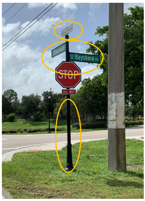
Presently exists in Canal Pointe Neighborhood completed as part of Pilot Project (SW Oakridge Dr.)