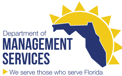
Exhibit A Scope of Work