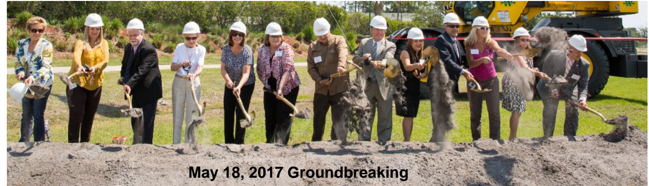
May 18, 2017 Groundbreaking