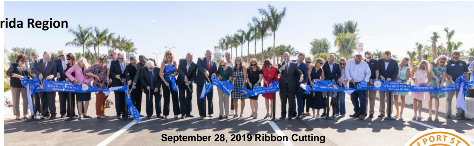
September 28, 2019 Ribbon Cutting