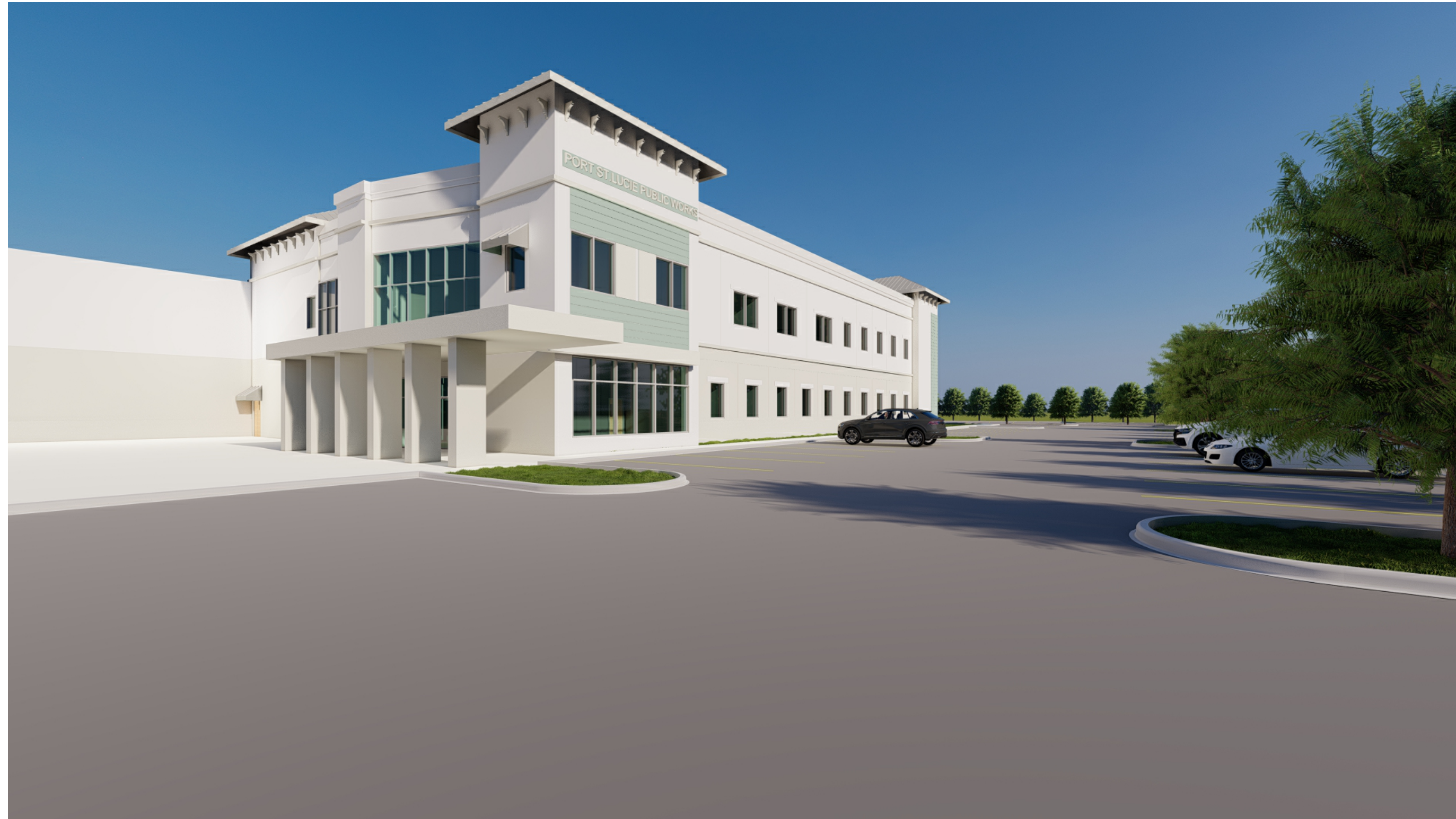
NORTH -EAST VIEW