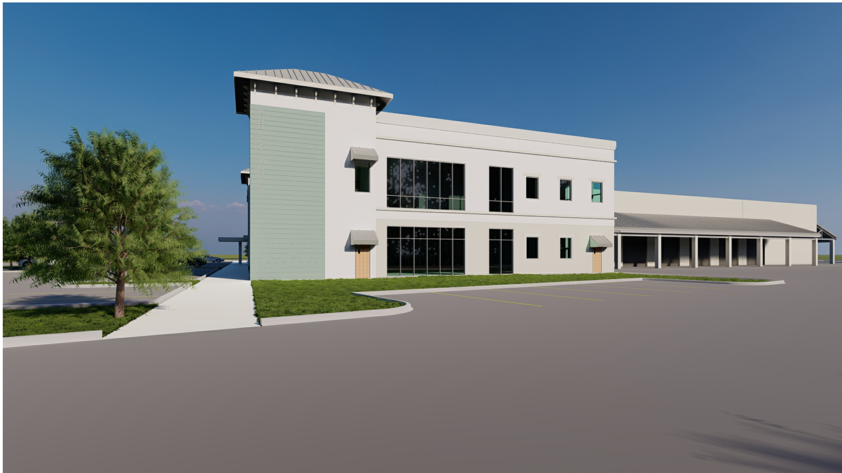
NORTH -WEST VIEW

PSL PUBLIC WORKS 460 THORNHILL DR. PORT ST. LUCIE, FL