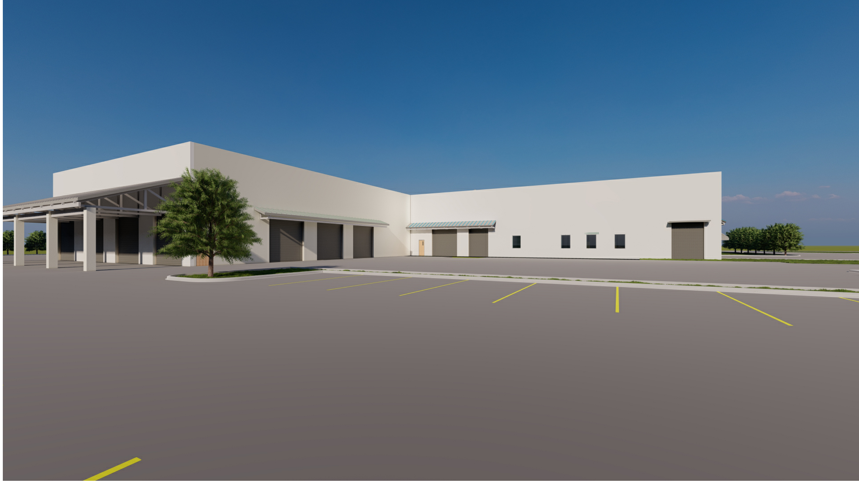
SOUTH -EAST VIEW