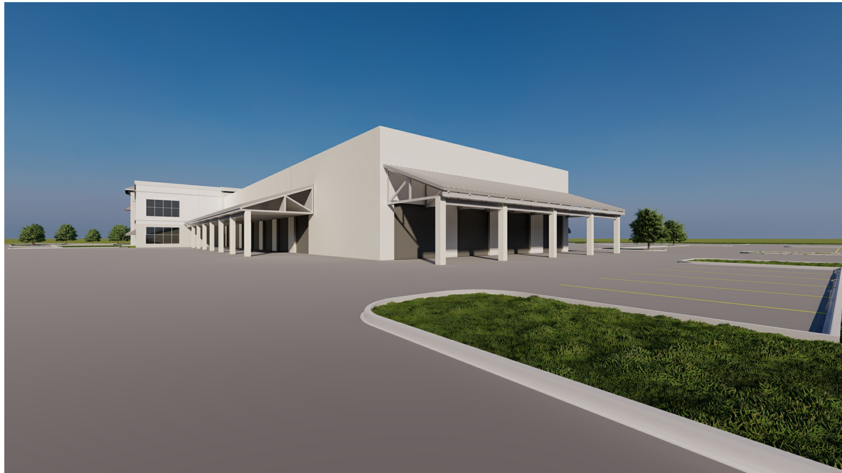
SOUTH -WEST VIEW