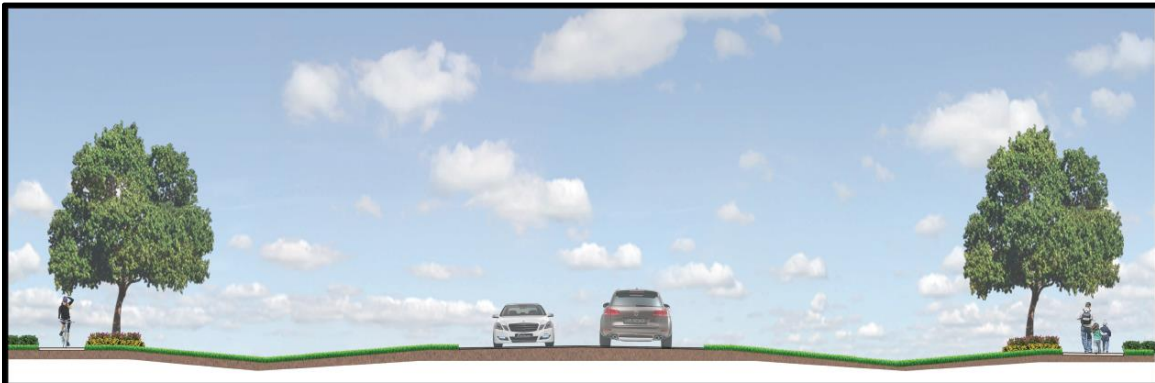
Figure 3. Future Becker Road & Gilson Road Roundabout