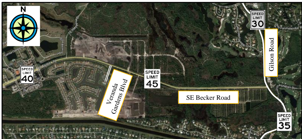
Figure 1. Posted Speed Limits

The posted speed on Becker Road is 40 mph from I-95 to Veranda Gardens Boulevard, a distance of 5.25 miles. The Gilson Road speed limit is 35 mph south of Becker Road and 30 mph north of Becker Road, as shown in Figure 1. The speed limit on this segment of Becker Road is inconsistent with the adjacent segments and may make it confusing for drivers and law enforcement to navigate and monitor the segment, respectively