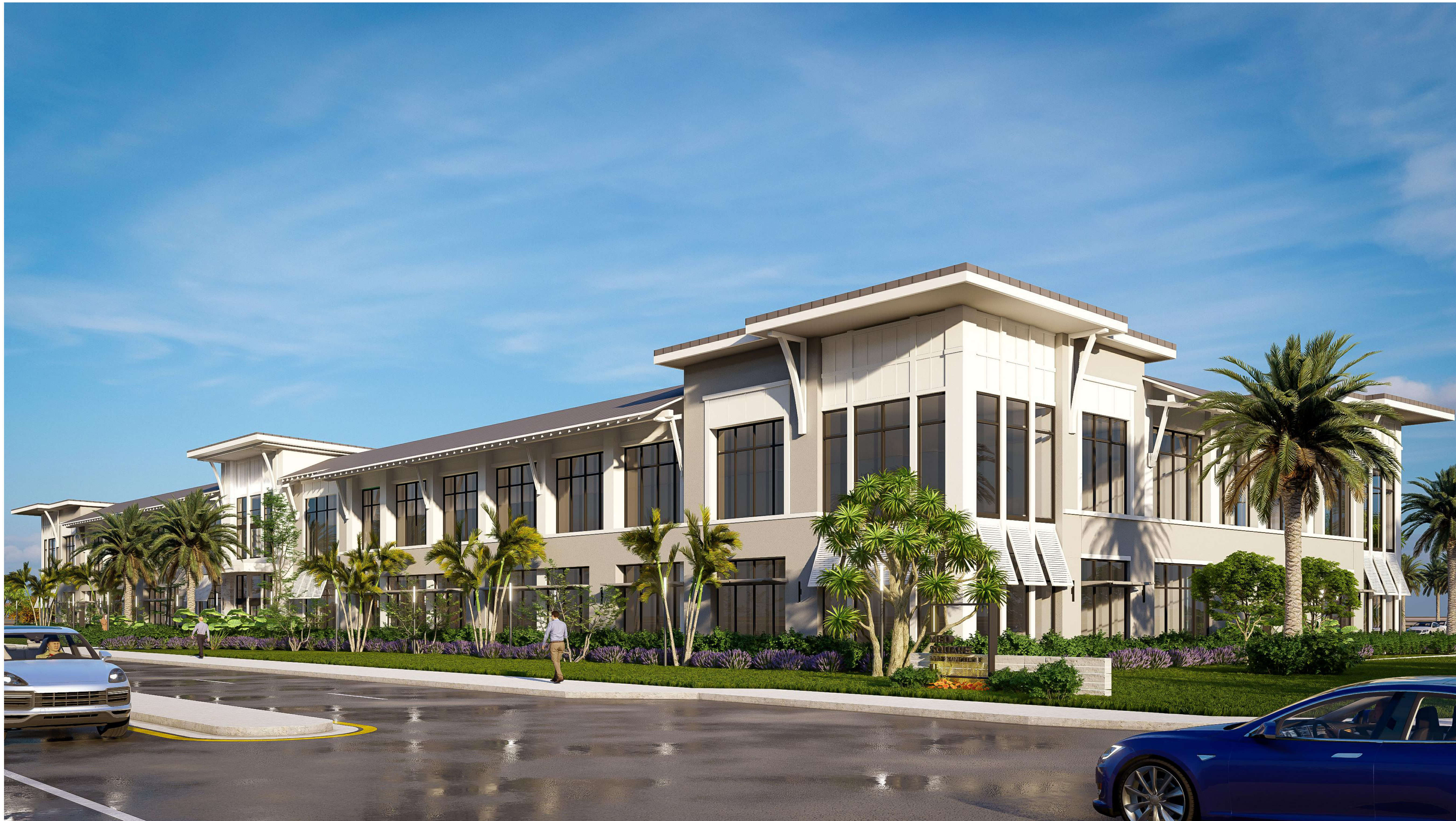
1 View from Becker Rd. SCALE: 1/2" = 1'-0"

Copyright © 2023 | MODIS ARCHITECTS, LLC | All Rights Reserved | C:\Users\Browndam\Documents\Project 23002_CD_Groundlevel\01.dwg