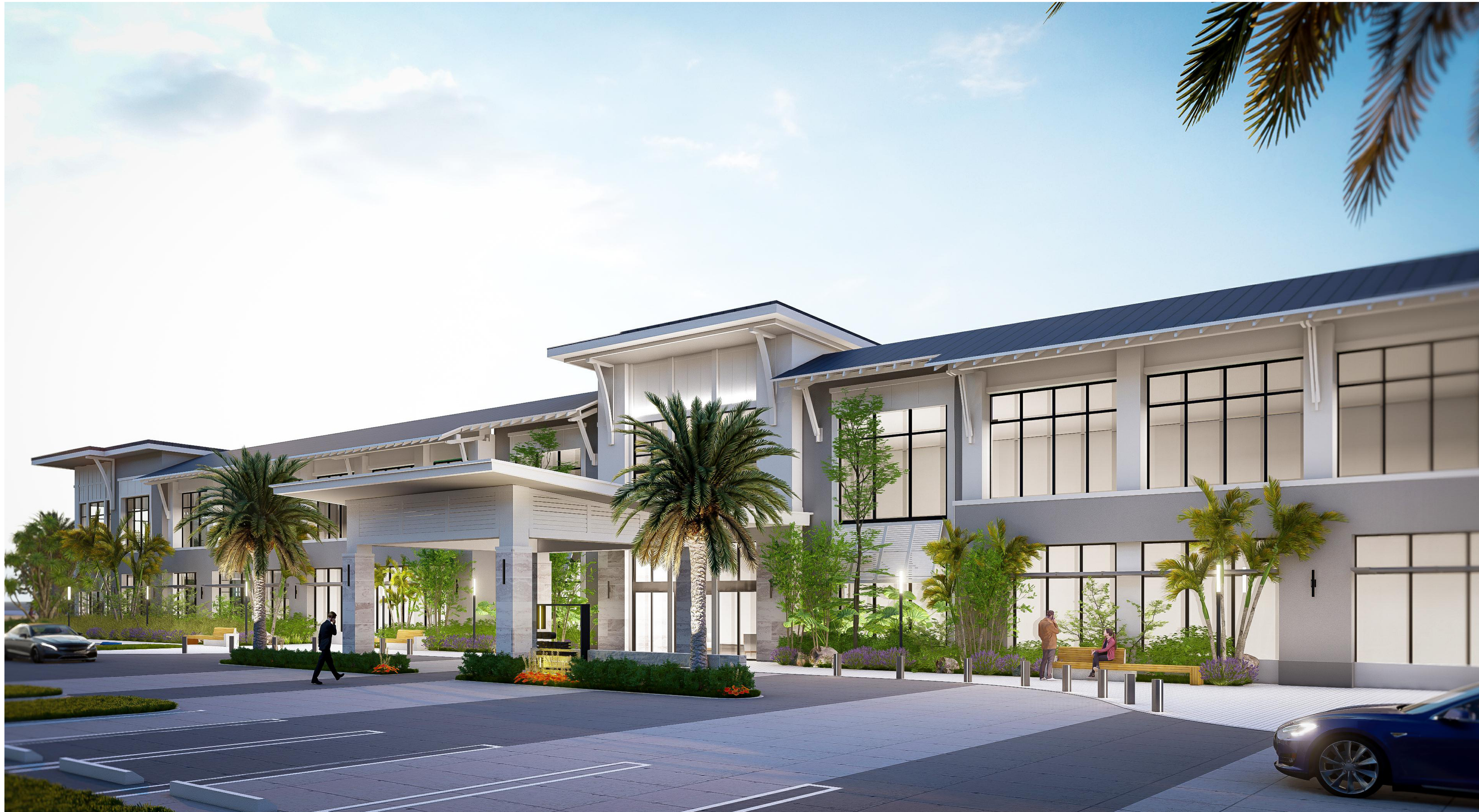
1 Drop-Off Entrance View SCALE: 1/2" = 1'-0"

Copyright © 2023 MODIS ARCHITECTS, LLC. All Rights Reserved | C:\Users\Bouradem\Documents\Project 23002_CD_04\render\001.rvt