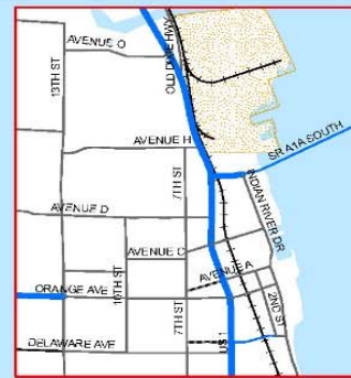
Downtown Fort Pierce Inset