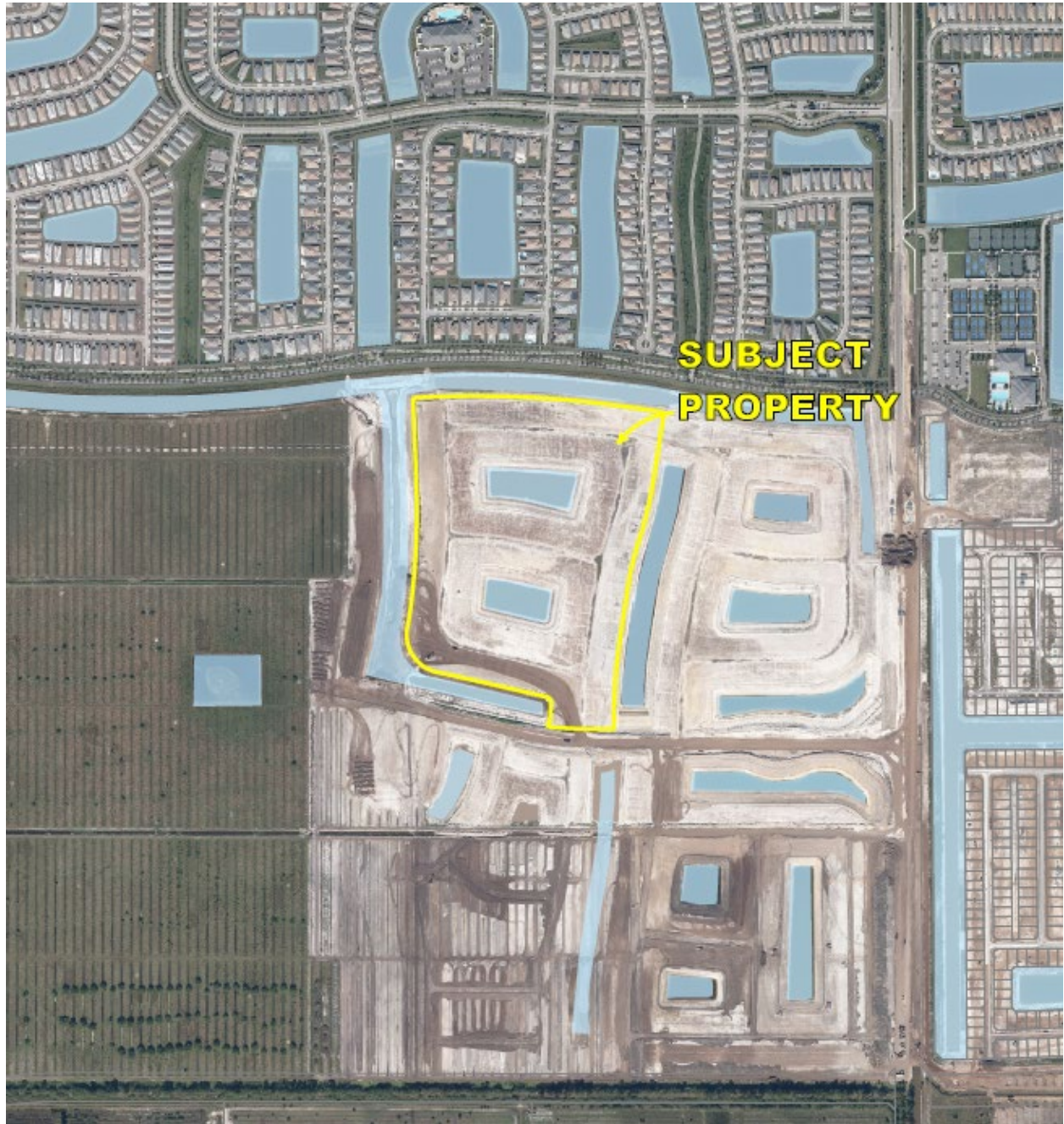
Project Location Map