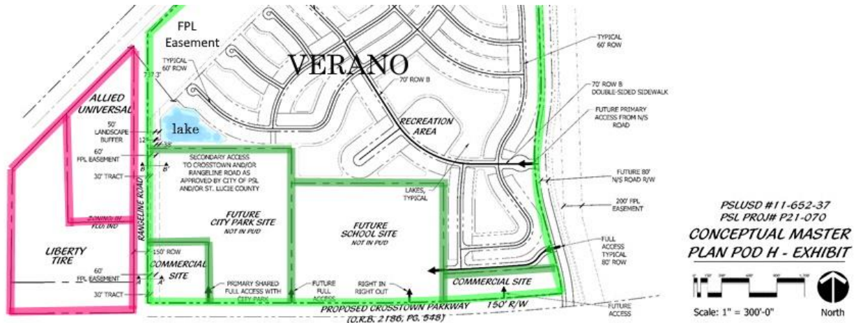
Figure 5. Verano Pod H PUD (P21-070) – Currently Under Review – Not Approved

Verano representatives have indicated that they have provided a sufficient buffer. Except for the new corner commercial property, the proposed buffer width is wider in some areas than shown on the earlier Map H DRI Preliminary Master Plan.