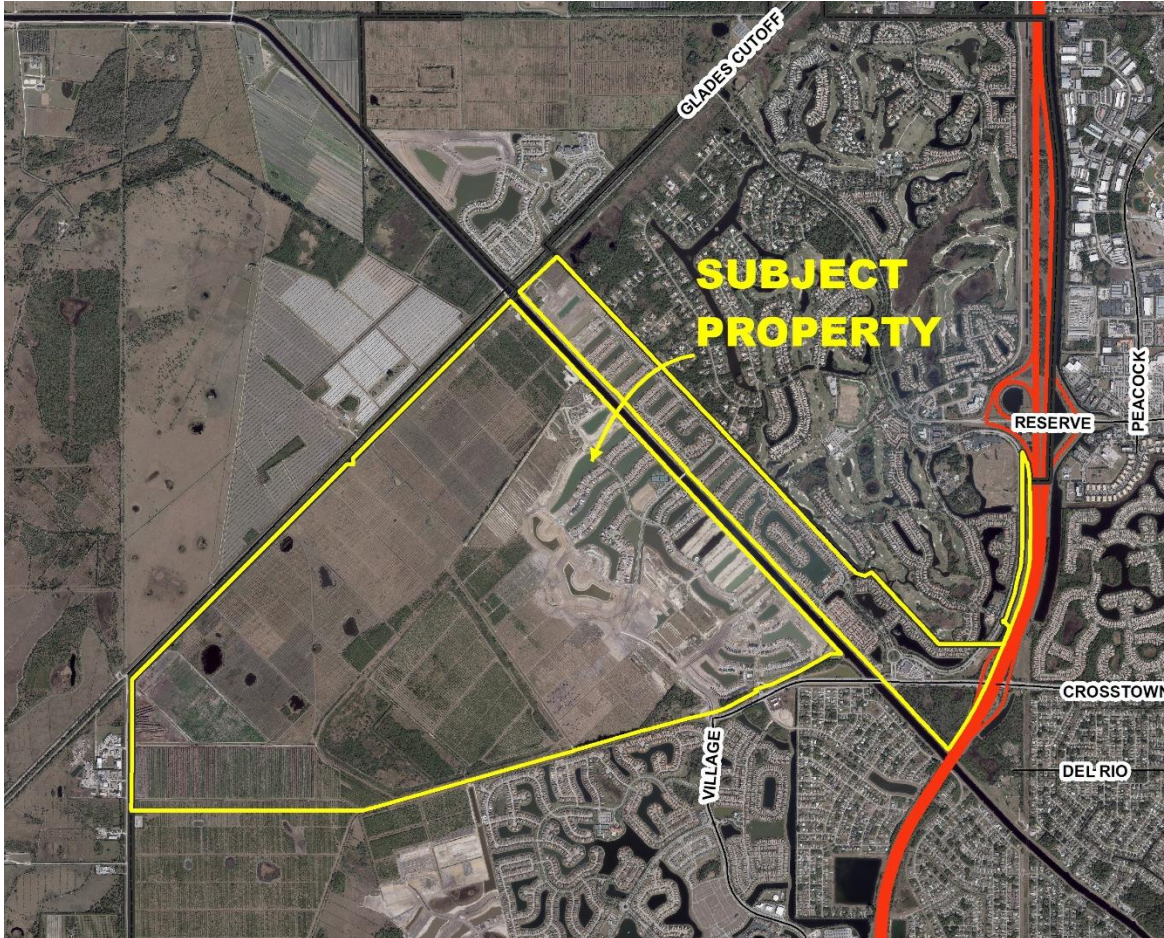
Figure 1. Aerial