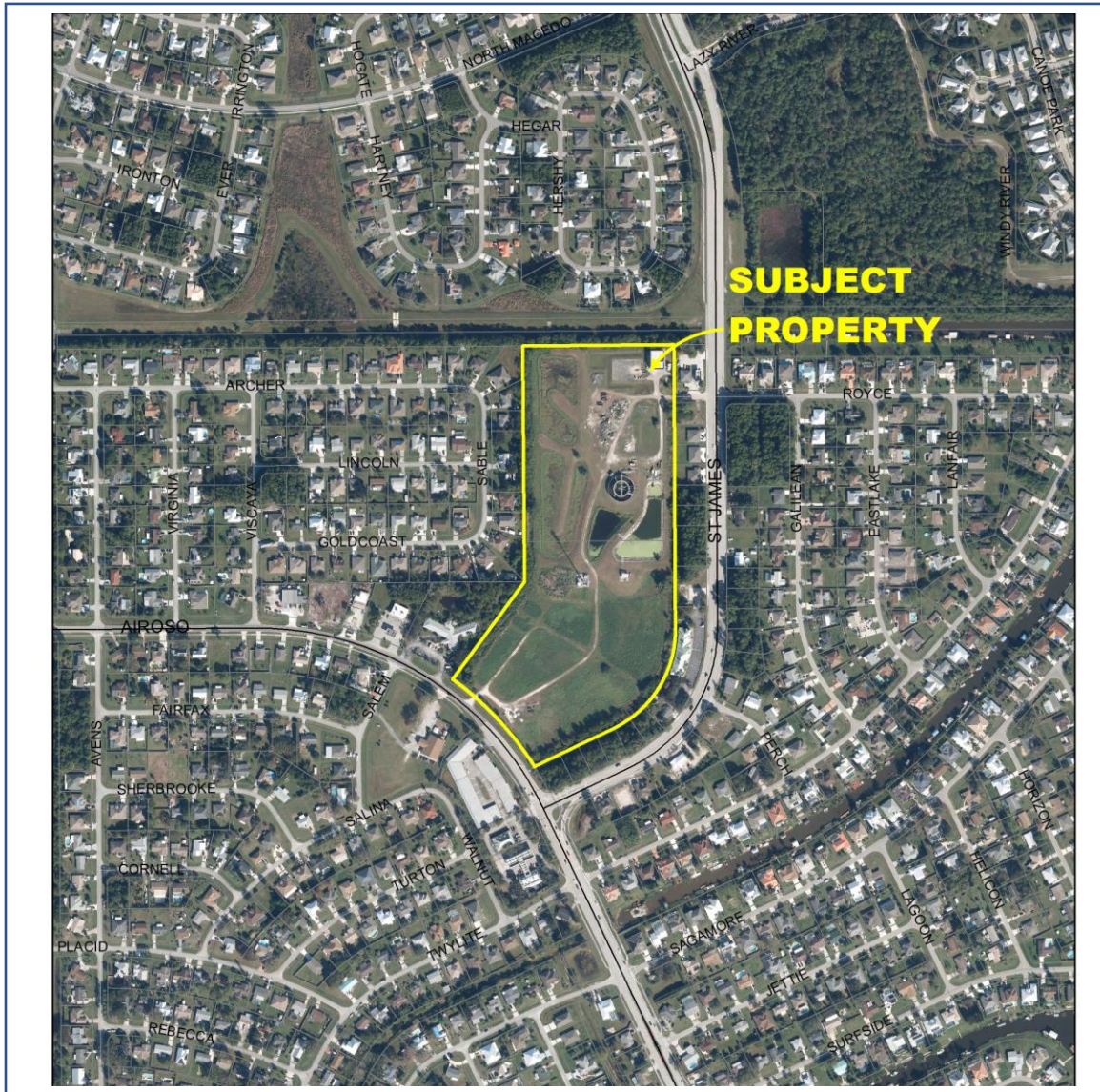
Project Location Map