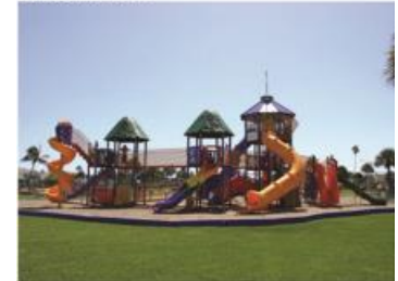
10. Adventure Playground