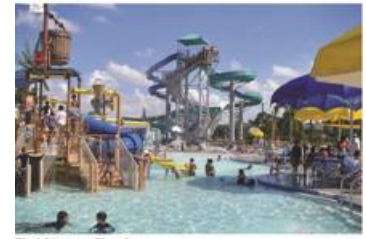
7. Water Park