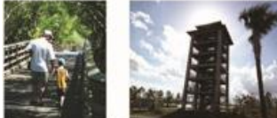
6. Observation Tower and Nature Walk