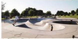
4. Skate Park