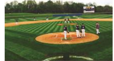
8. Baseball/ Softball Complex