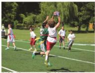
1. Multi-purpose Fields