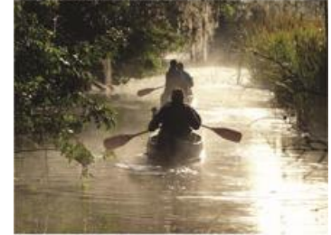
9. Kayak Trail