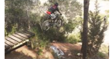
11. BMX Trail