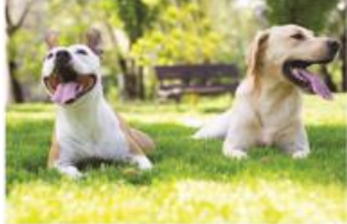
2. Bark Park