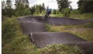
5. Pump Park