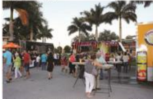
3. Food Truck/ Art Fest/ Event Space