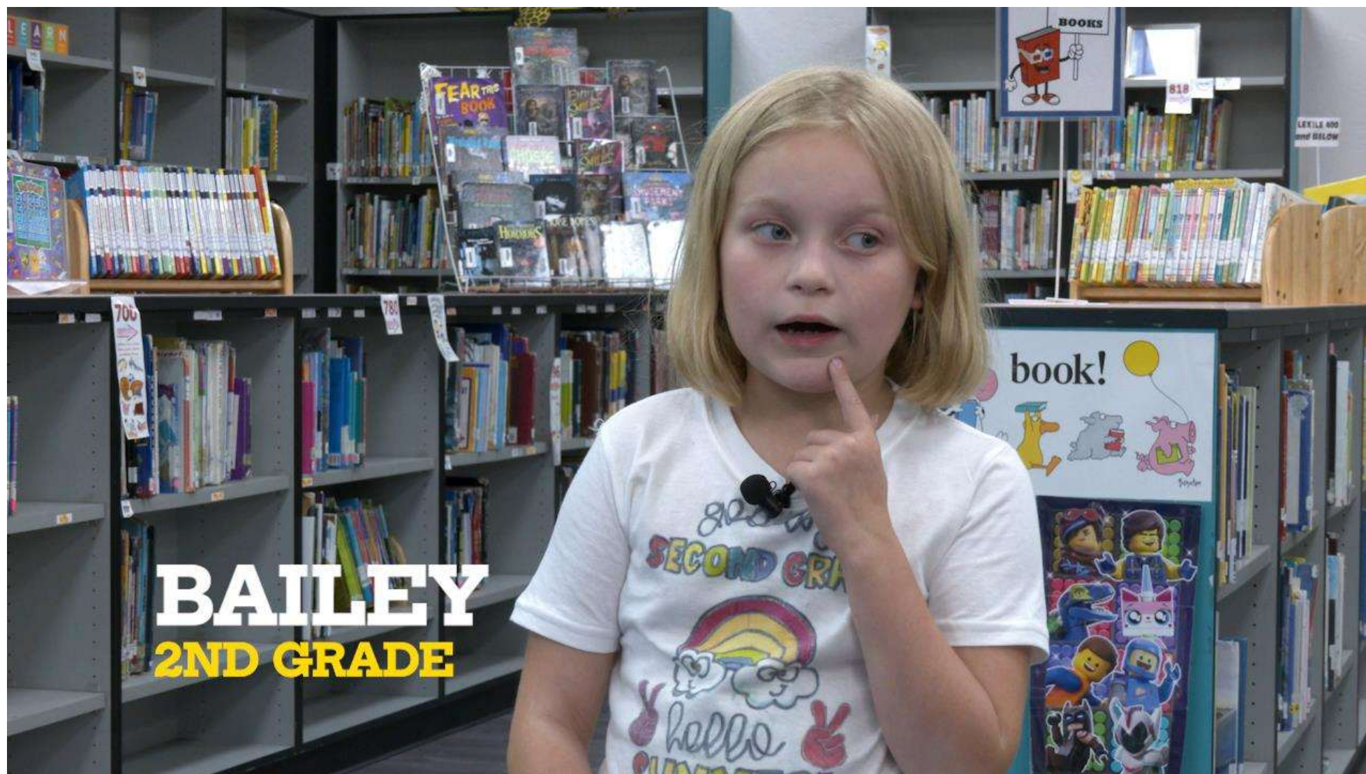
BAILEY 2ND GRADE