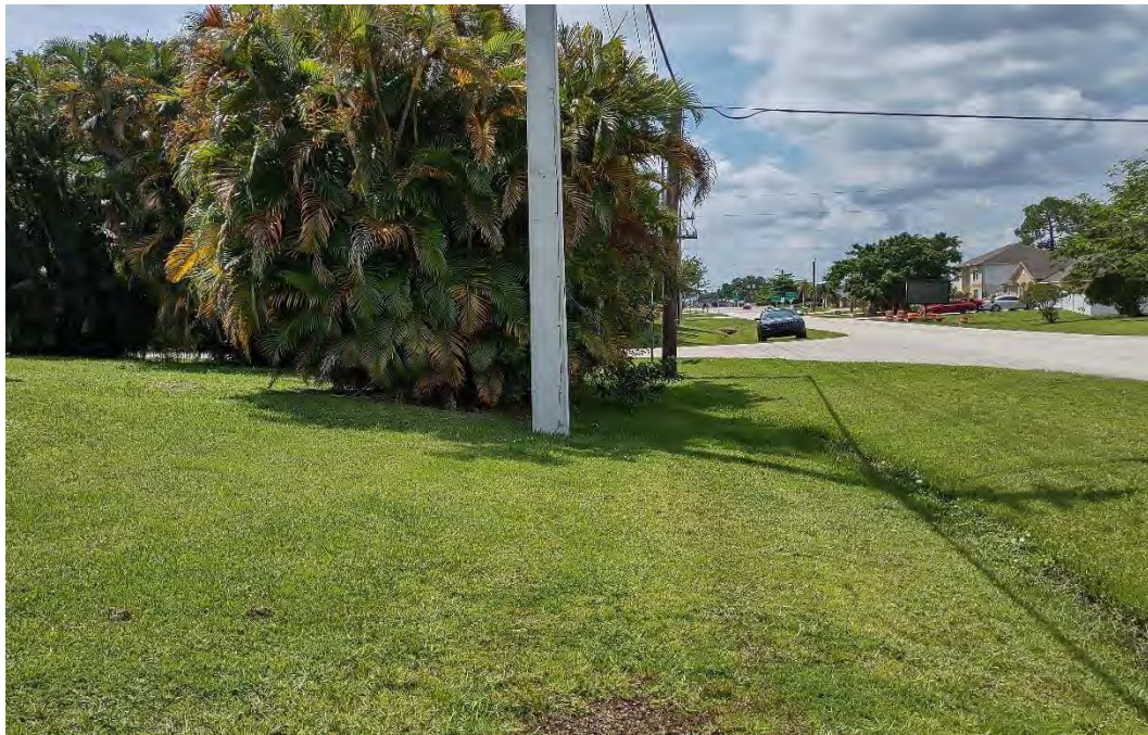
Southerly view subject's Floresta Blvd. frontage w/ acquisition left of FPL pole