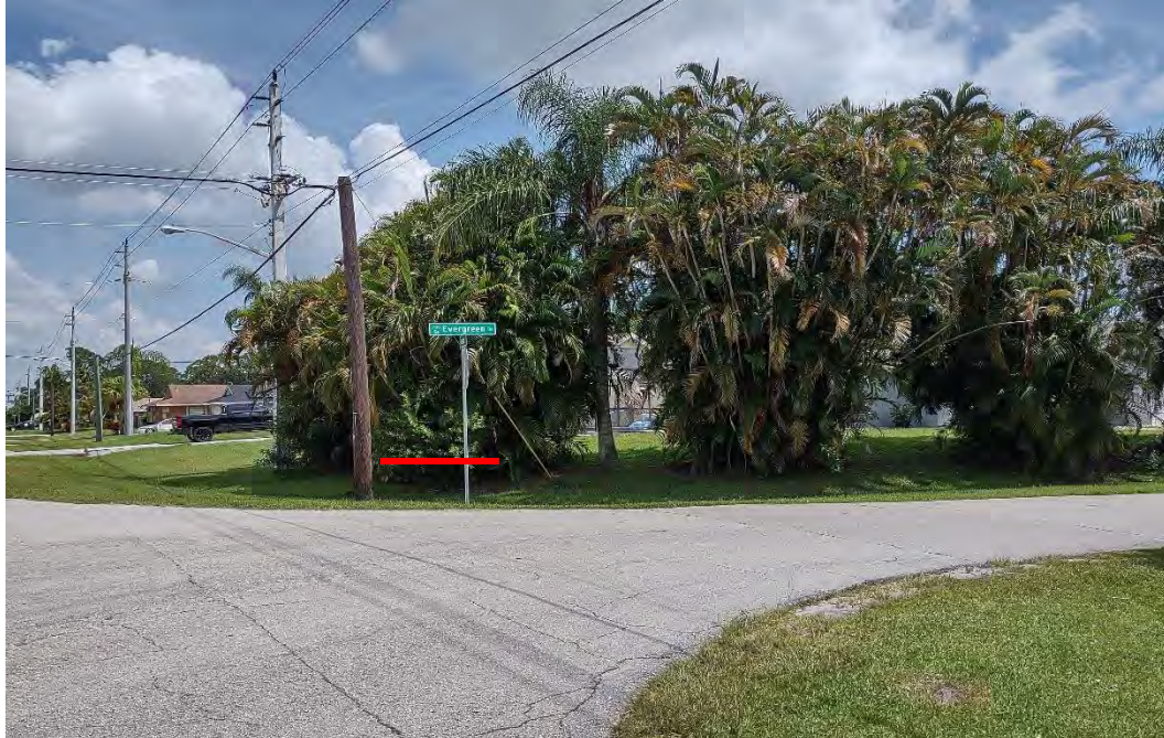
Subject's Floresta Drive frontage & approximate location of acquisition (red line)