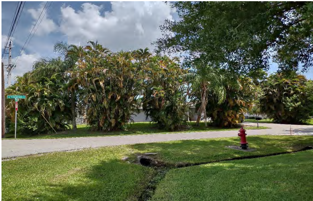
Subject's Evergreen Terrace frontage