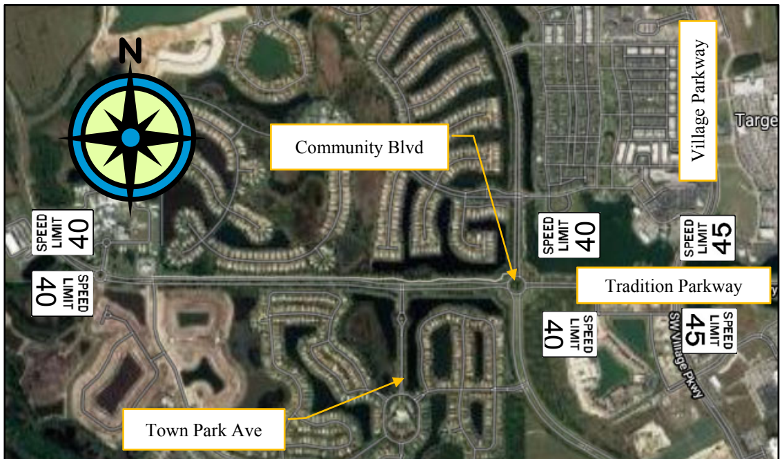
Figure 1. Proposed Posted Speed