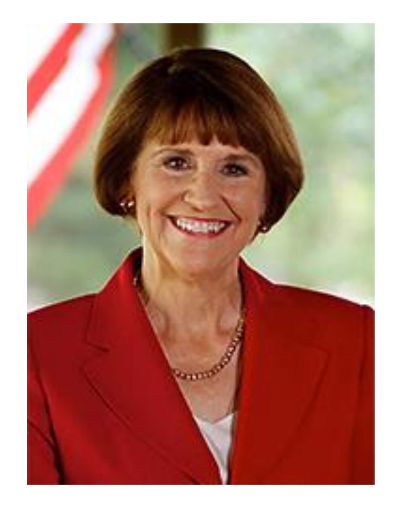
State Senator Gayle Harrell