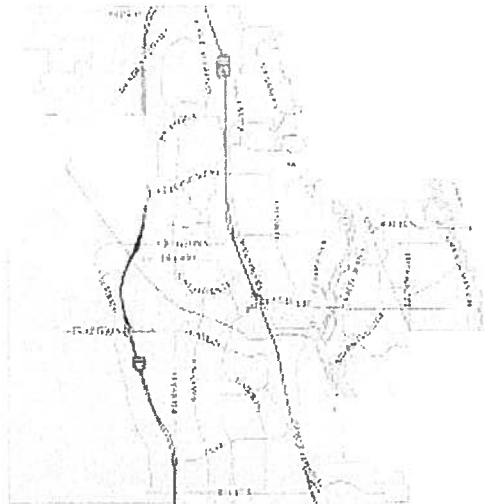
EXHIBIT "C" TO RESOLUTION 21-R SOLID WASTE PROOF OF PUBLICATIC

Sally Walsh, City Clerk Publish Area to be assessed