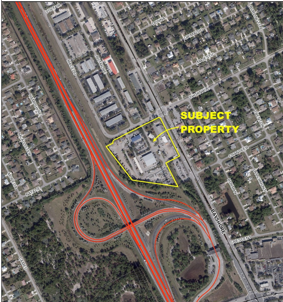
Project Aerial Map