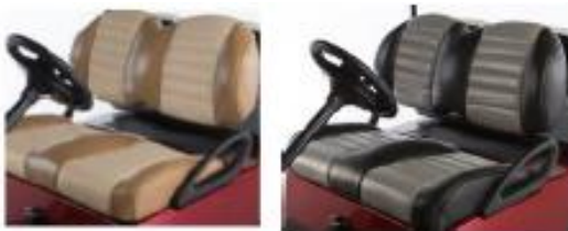
Camello & Light-Beige