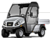
Street Legal (LSV)