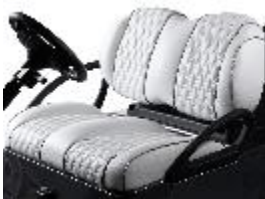
Elite Bright White w/Silver Rush Stitching & Piping