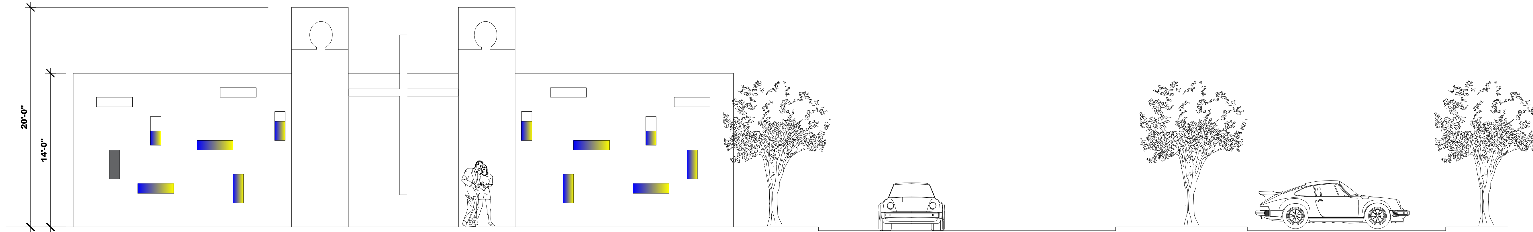
PHASE I SOUTH ELEVATION

Building phase i will be add kitchen, classrooms, conference room, bible study, offices, reception.