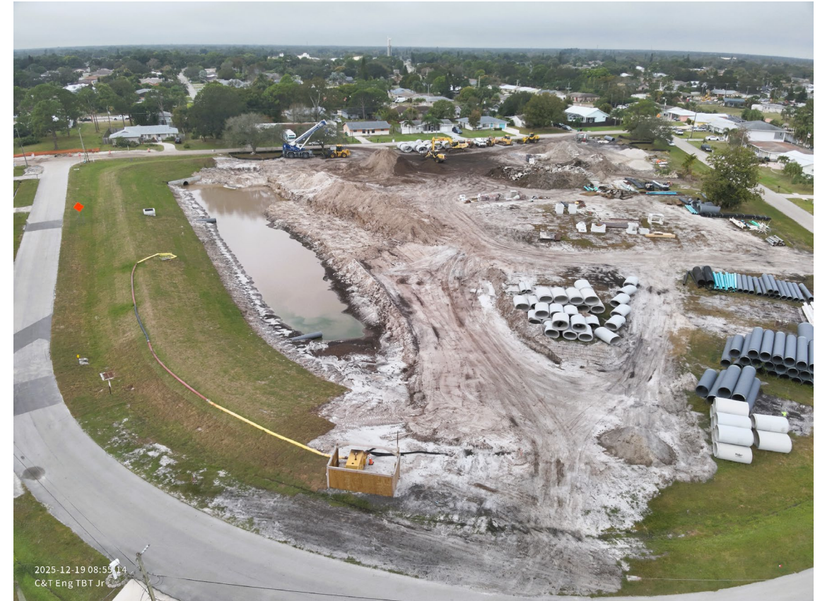
Harbour View Stormwater Pond Activities