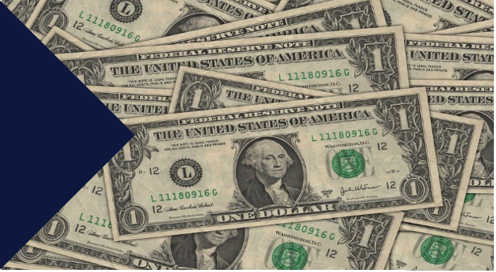
Monthly Half-Cents Sales Tax Revenue

MA = Monthly Allowance QA = Quarterly Allowance