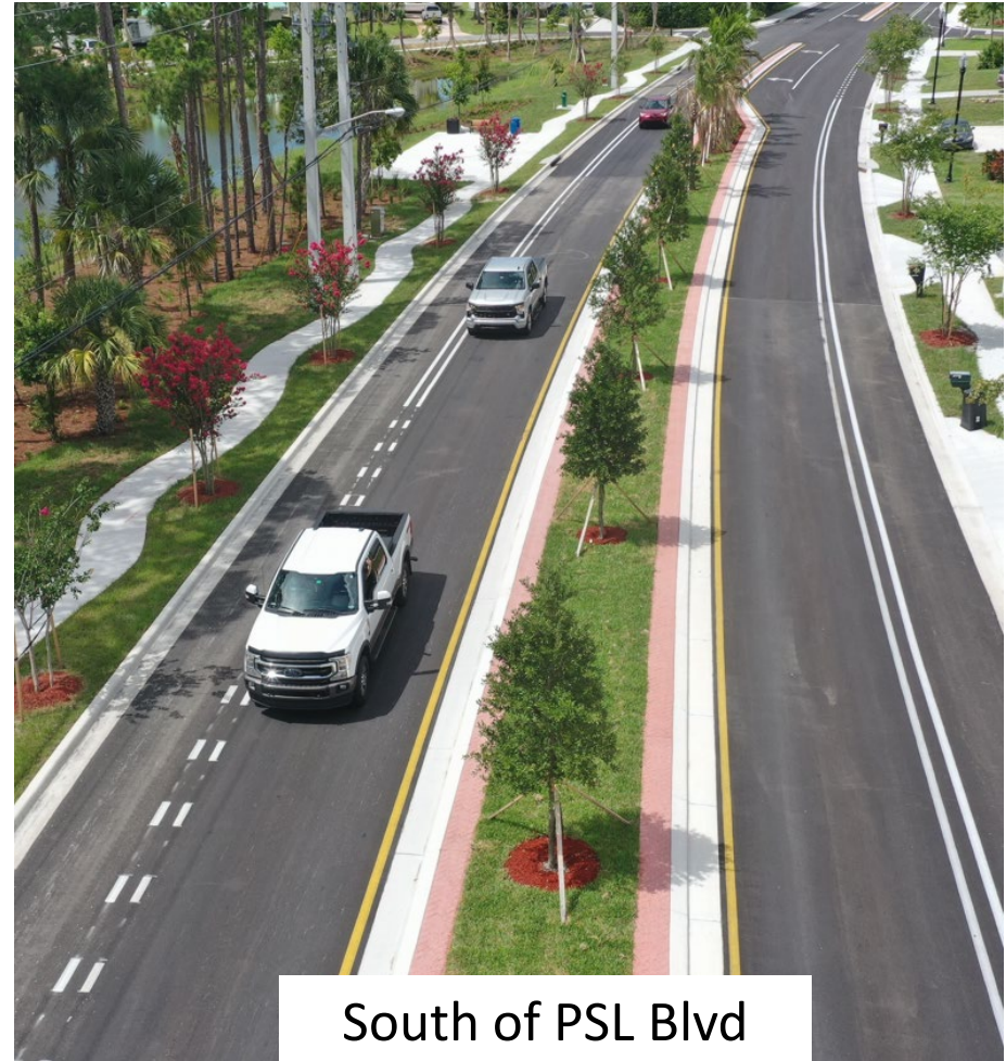
South of PSL Blvd