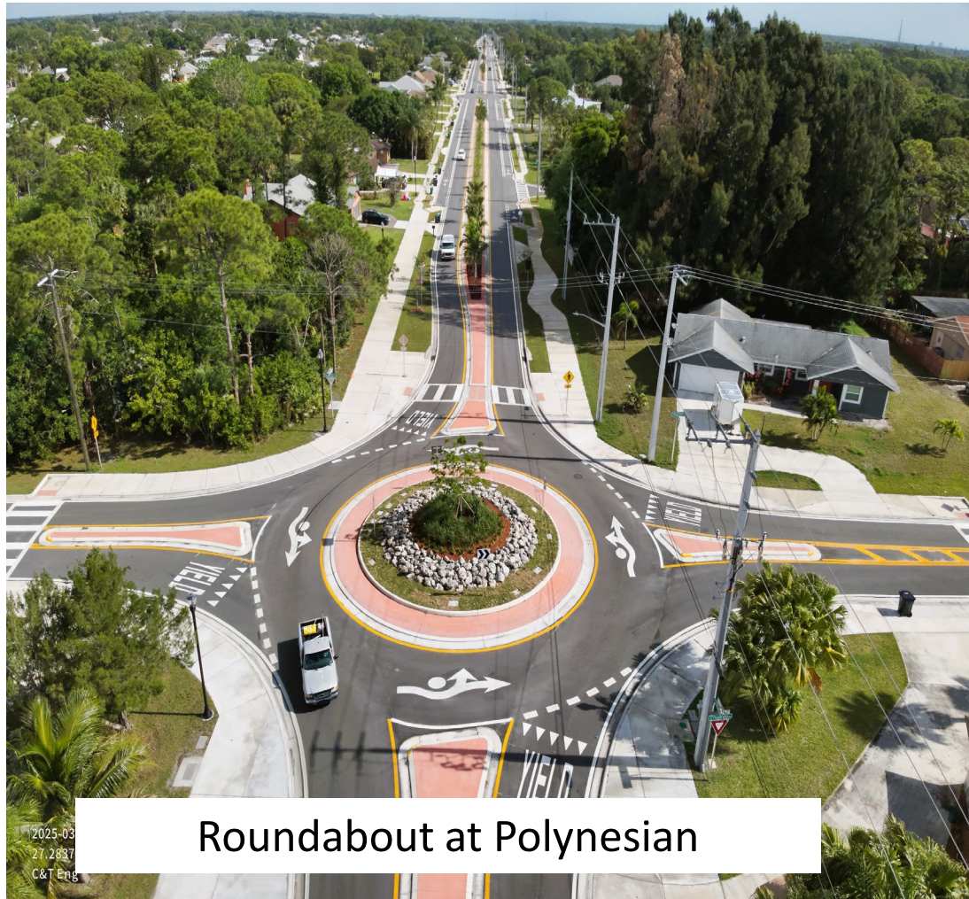
Roundabout at Polynesian