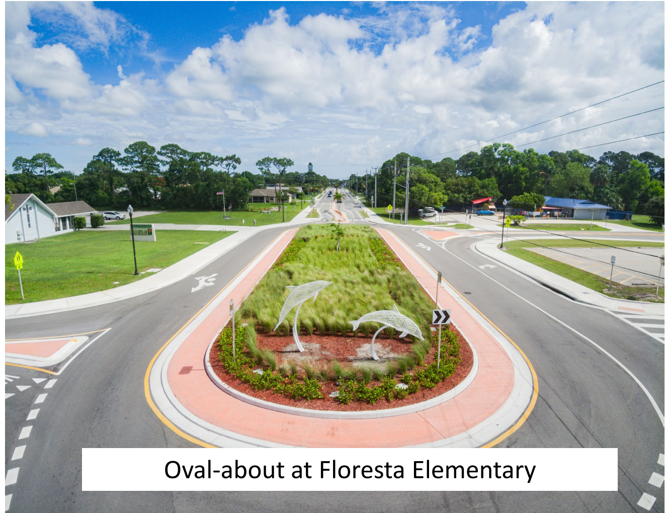
Oval-about at Floresta Elementary