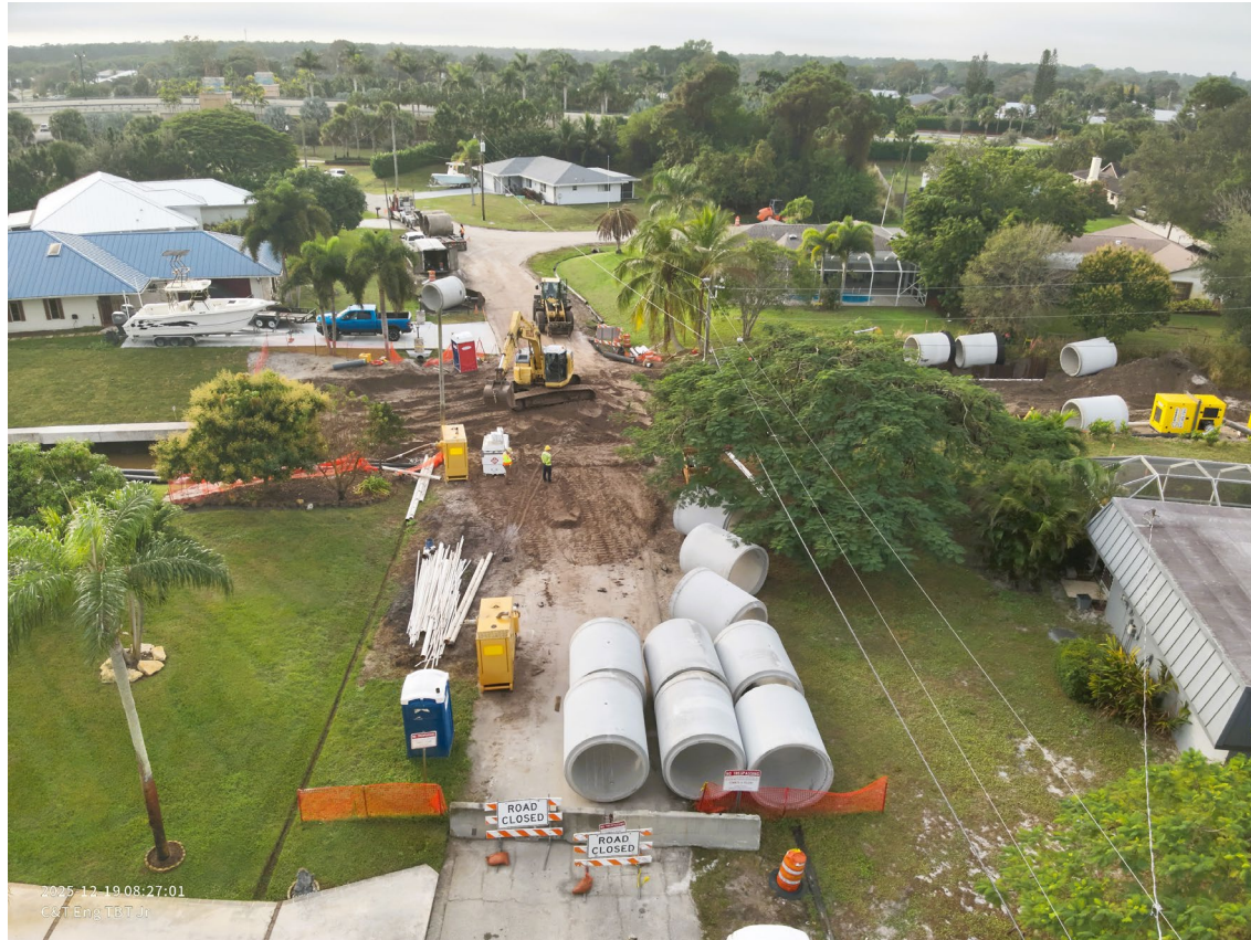
Floresta Drive Phase 3 – D-11 Canal Activities