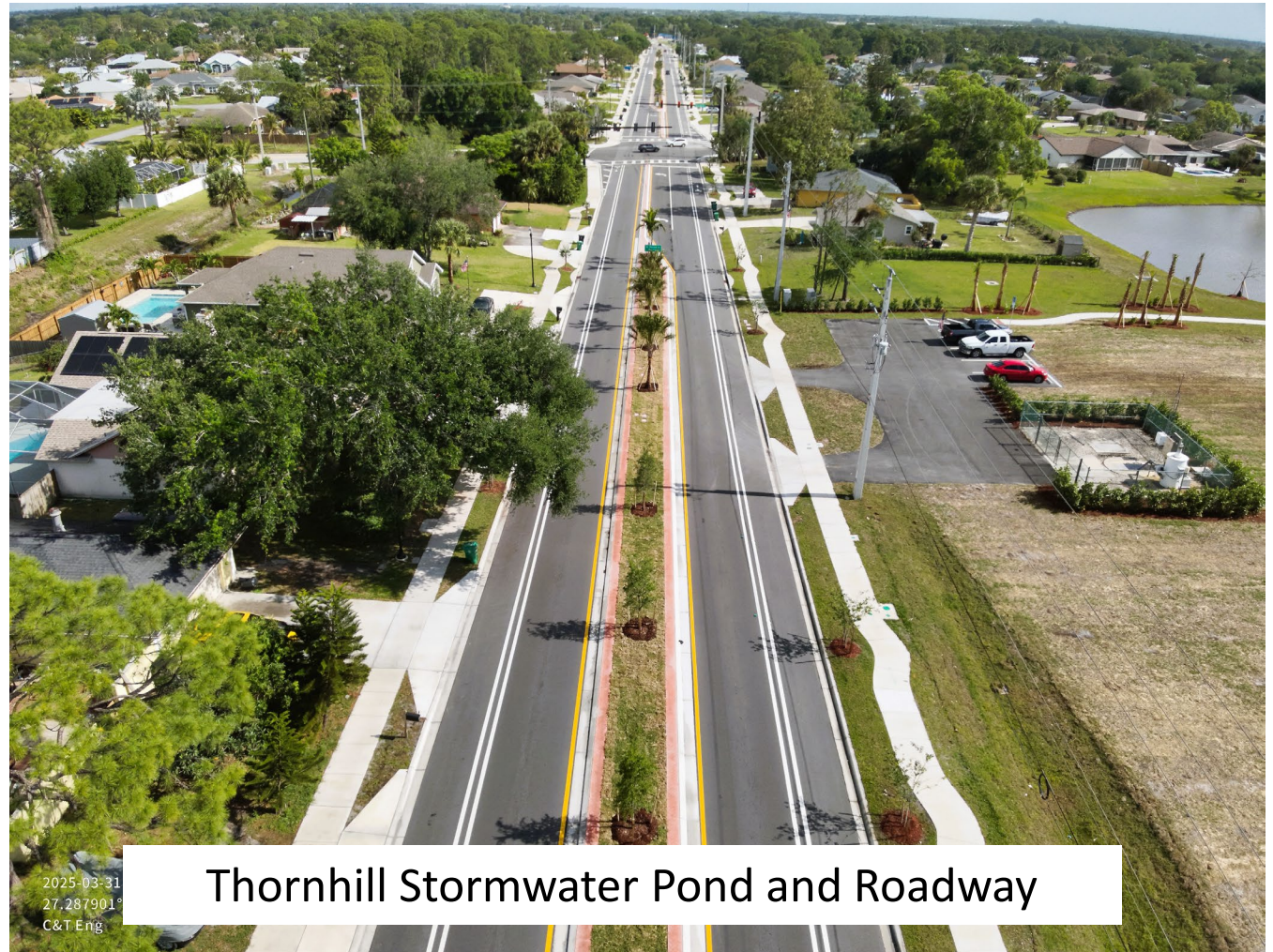
Thornhill Stormwater Pond and Roadway