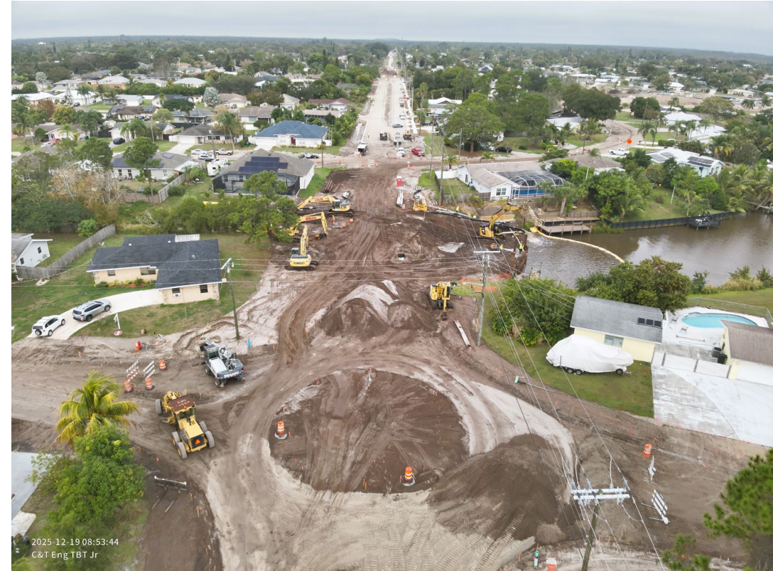
Floresta Drive Phase 3 Activities