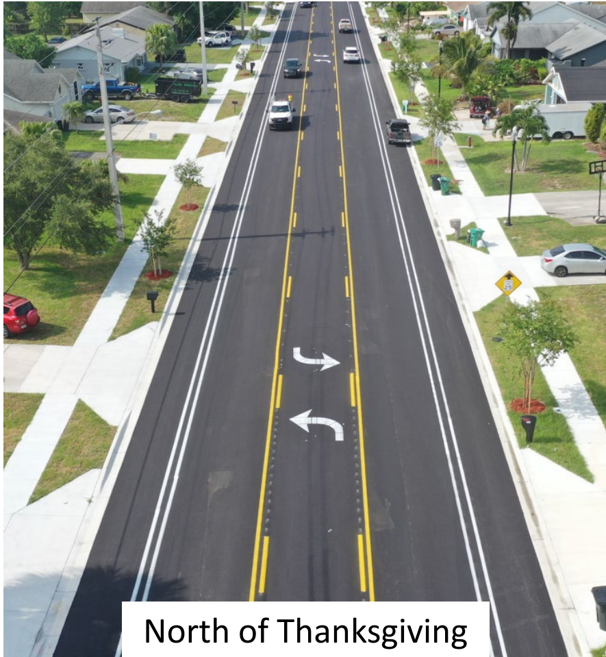
North of Thanksgiving