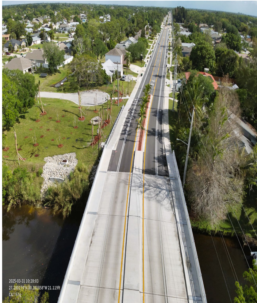
Final Roadway Configuration Elkcam Bridge through Polynesian Ave