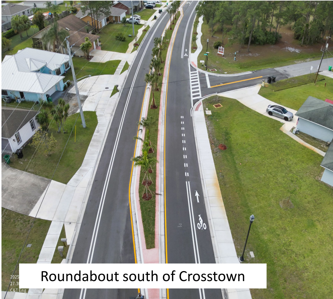
Roundabout south of Crosstown