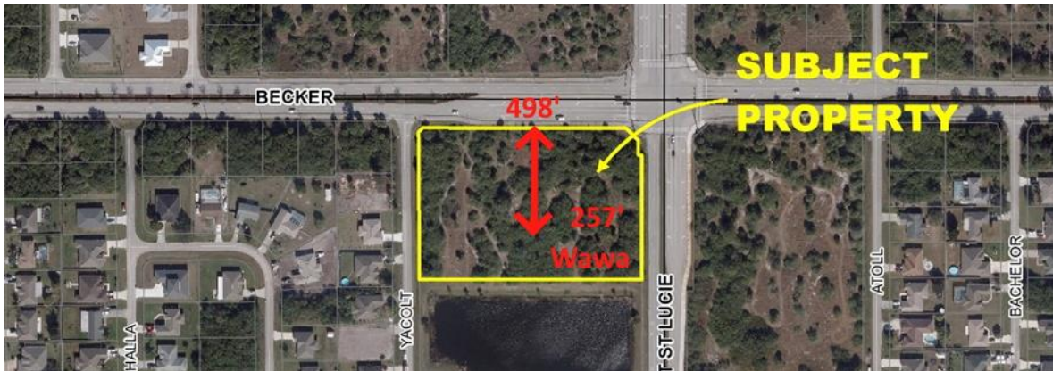
Figure 2. Block and Driveway Location Diagram

Variance Requested: The applicant is requesting a variance to allow a driveway to extend into the site from Becker Road at the middle of the block.