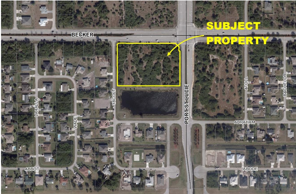
Figure 1. Aerial Map