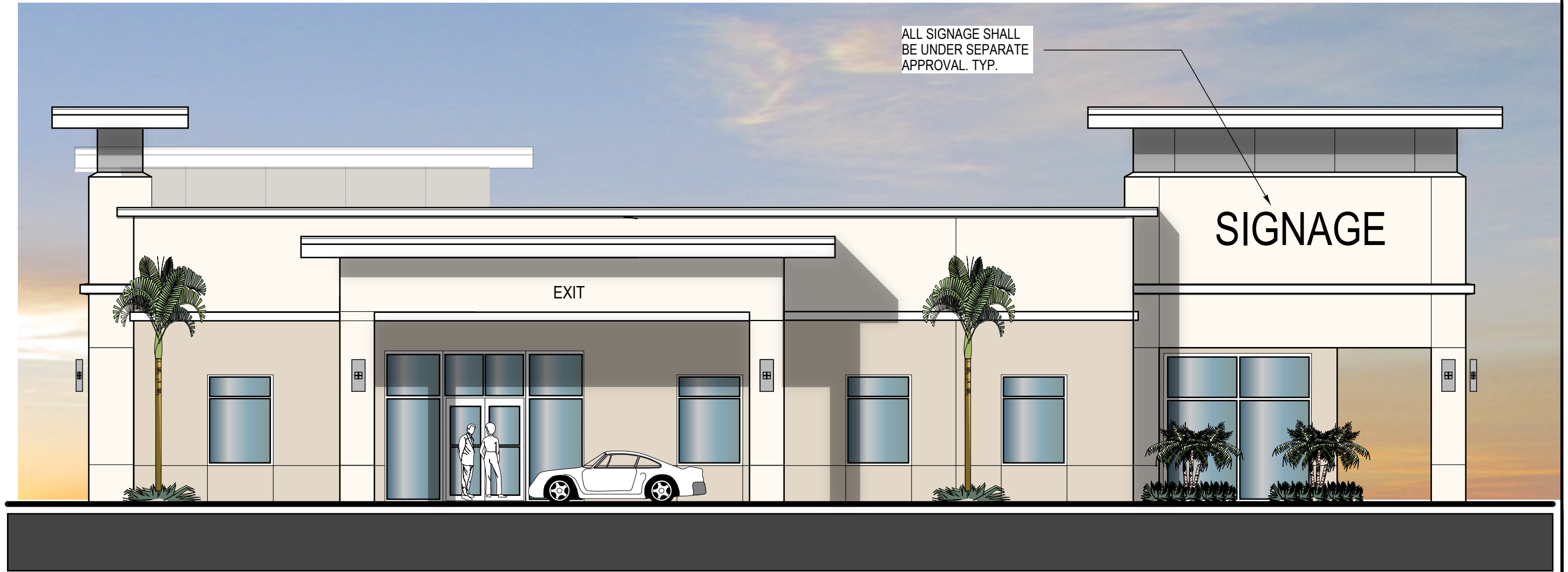
SIDE (WEST) ELEVATION 1/8" = 1'-0"