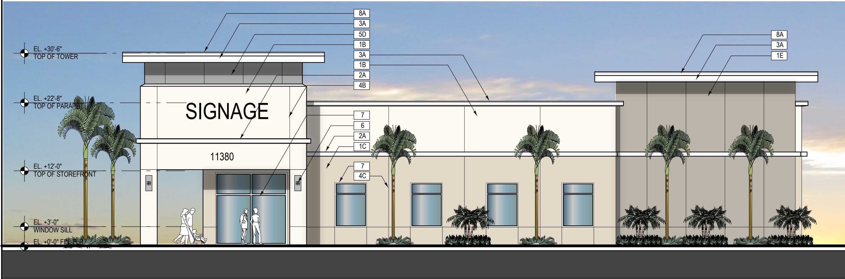
SIDE (EAST) ELEVATION 1/8" = 1'-0"