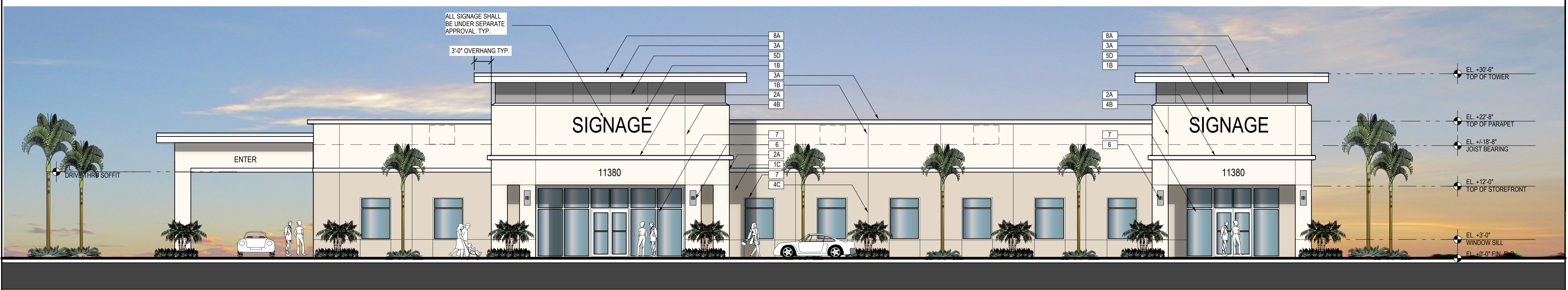
FRONT (SOUTH) ELEVATION BUILDING 1/8" = 1'-0"