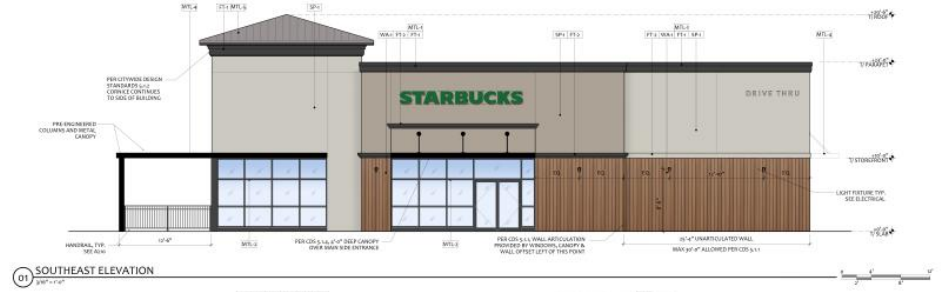
01 SOUTHEAST ELEVATION 1/8" = 1'-0"