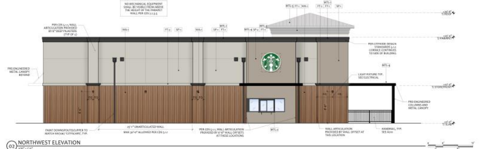
02 NORTHWEST ELEVATION 1/8" = 1'-0"