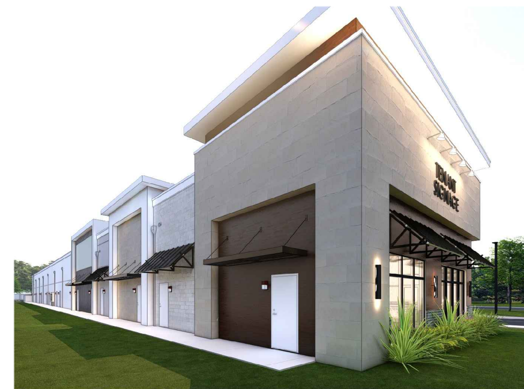
REAR ELEVATION - PORT SAINT LUCIE BLVD