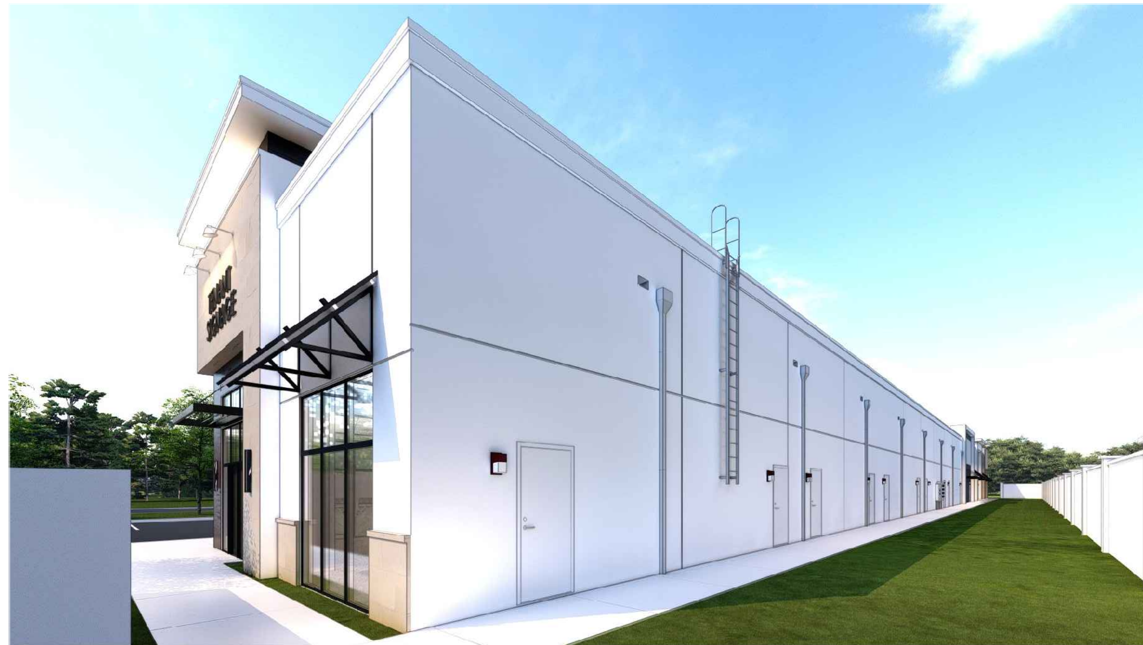
REAR ELEVATION - PARKING LOT