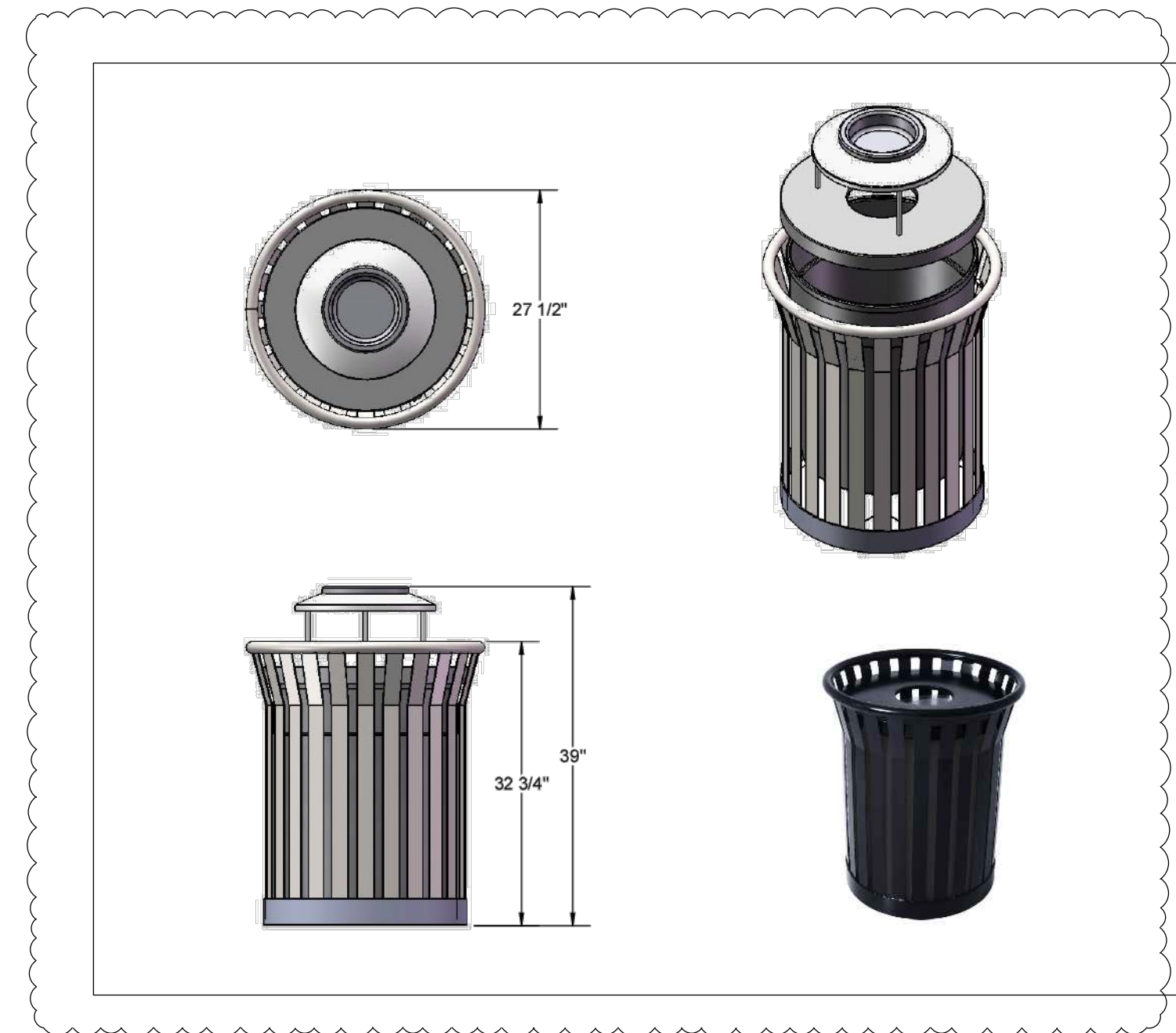
TRASH CAN DETAILS - 32 GALLON