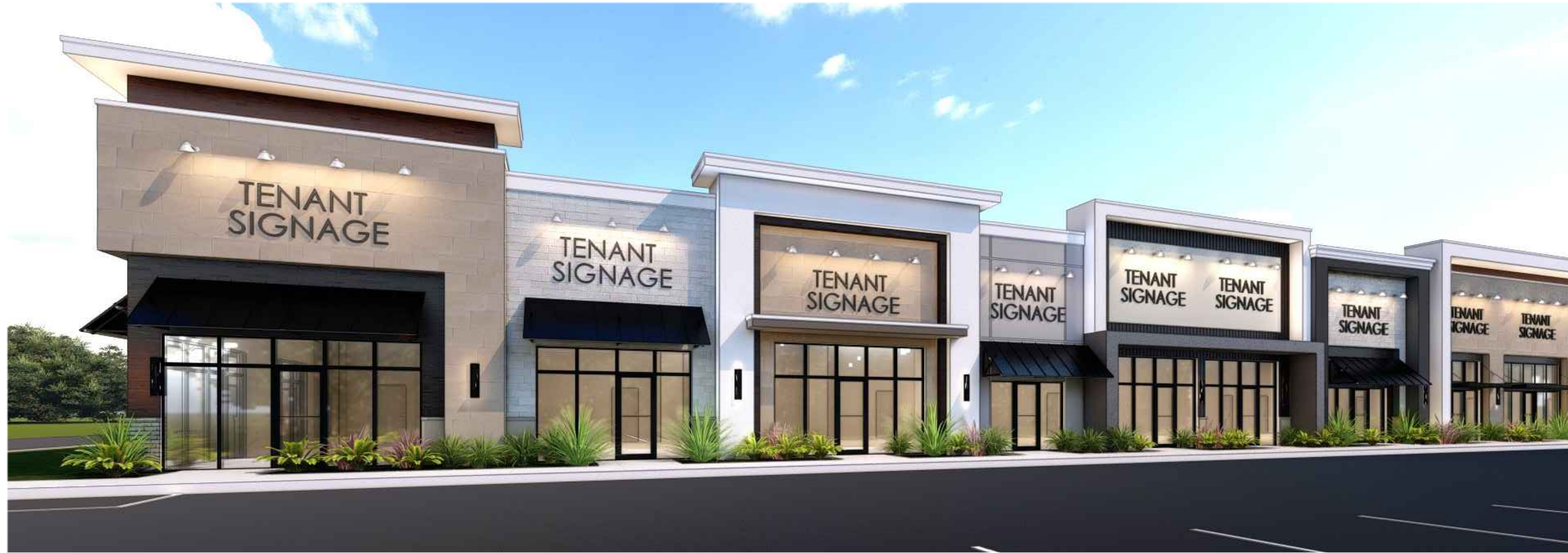
FRONT ELEVATION - PARKING LOT