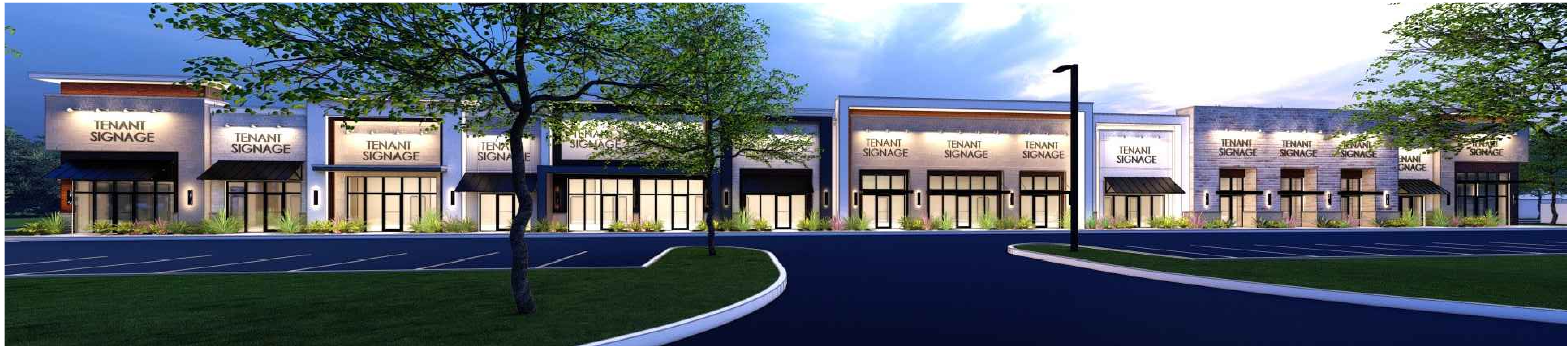
FRONT ELEVATION - PARKING LOT