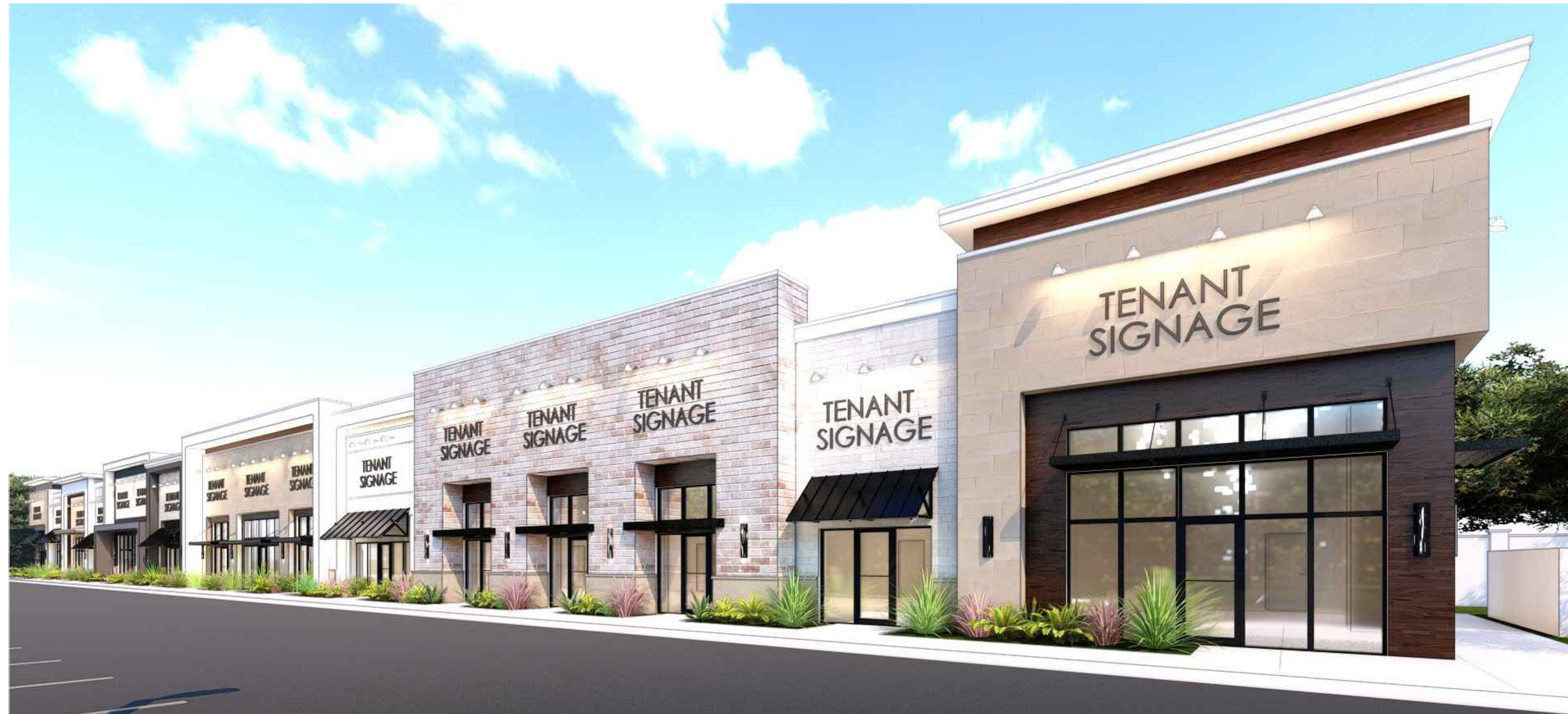
FRONT ELEVATION - PARKING LOT