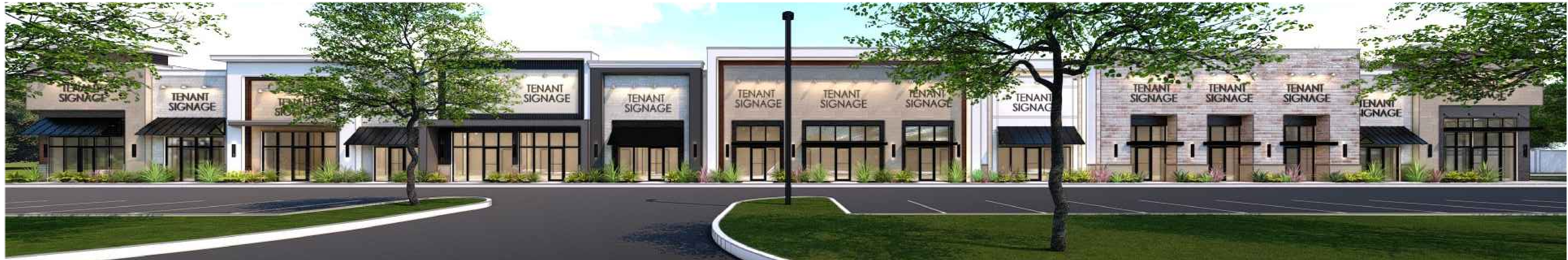
FRONT ELEVATION - SULTAN DRIVE