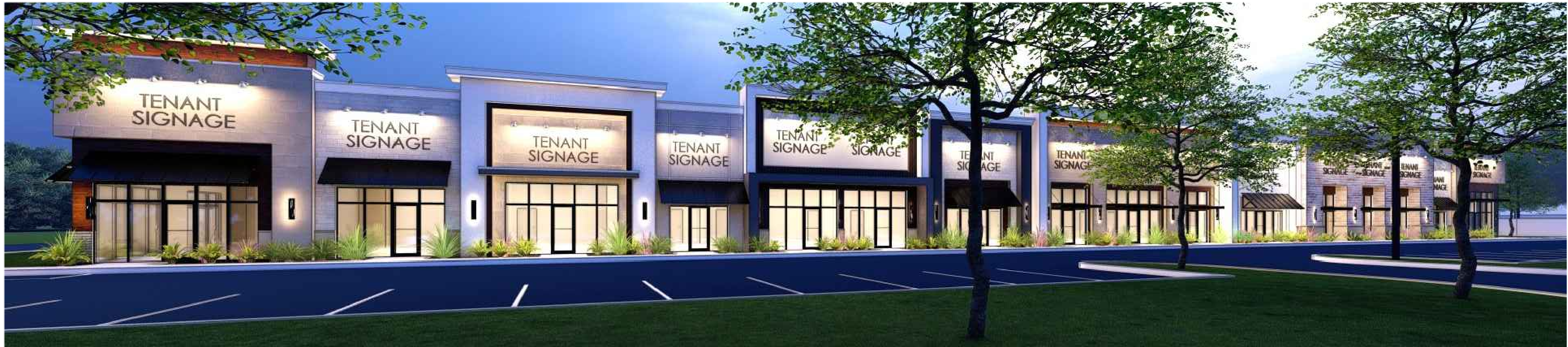
FRONT ELEVATION - PARKING LOT