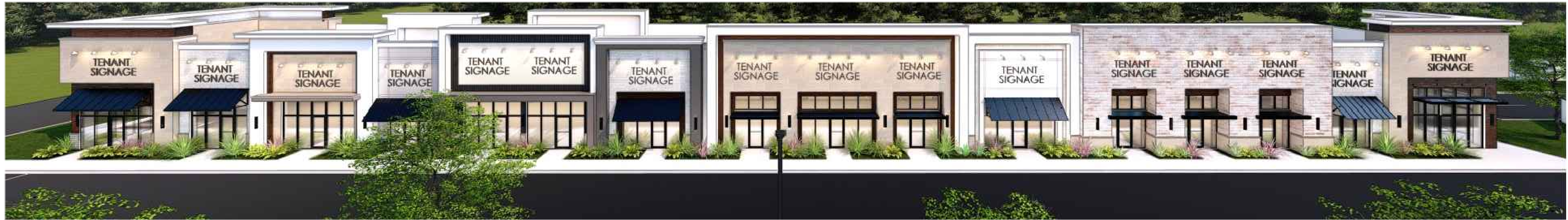
FRONT ELEVATION - SULTAN DRIVE