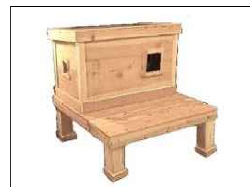
Typical Cat Feeding Station Detail