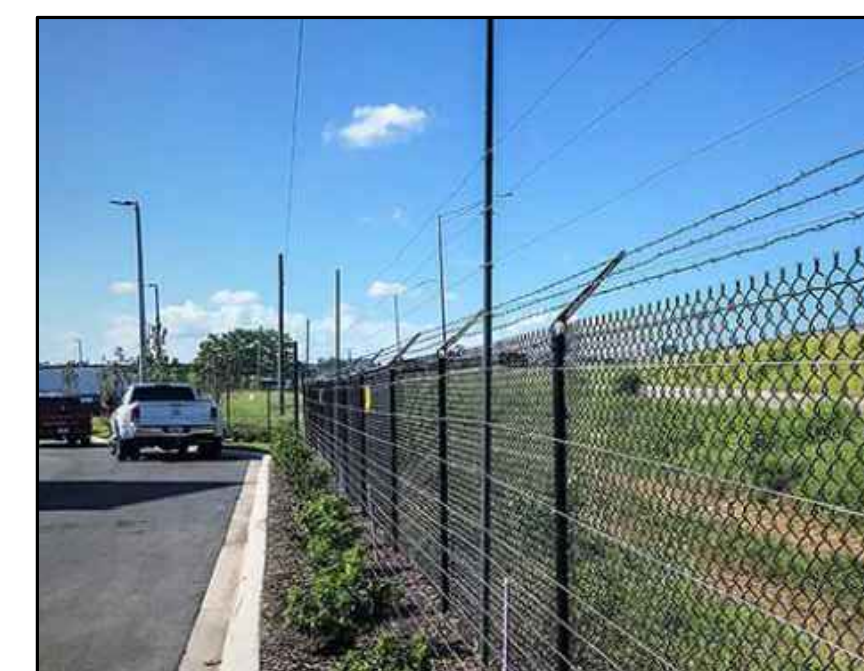
Typical Chain Link Fencing Detail

Cat Colony 1-3 Move Time: 60 Days Allowance