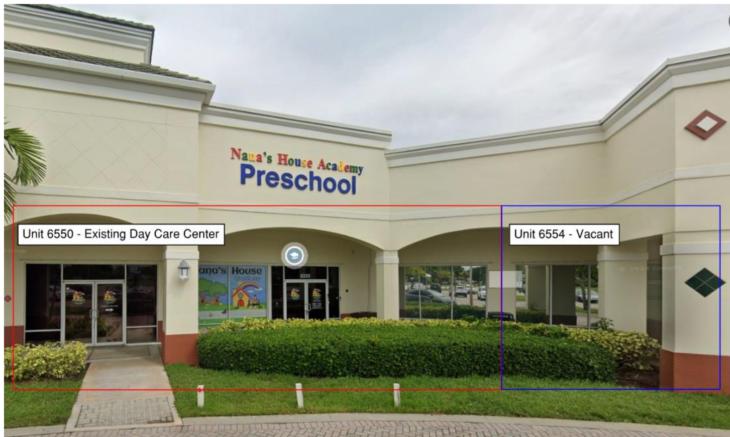
Unit 6550 - Existing Day Care Center