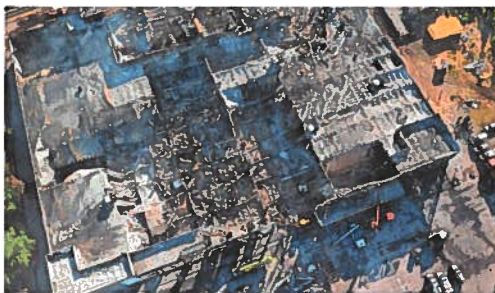
Ukrainian State Emergency Service firefighters work to take away debris at a shopping center burned after a rocket attack in Kremenchuk, Ukraine, on Tuesday.