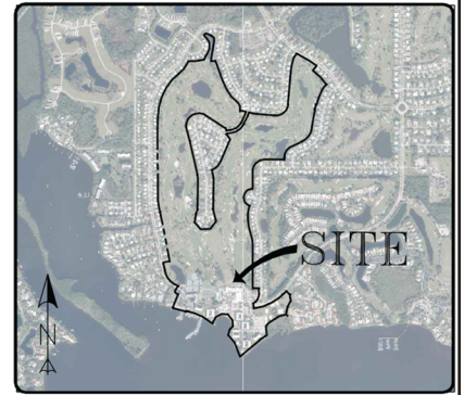
PORT ST. LUCIE, FLORIDA VICINITY MAP 1" = 4000'

FLU: RL EX ZONING: RS-3 EX USE: RESIDENTIAL