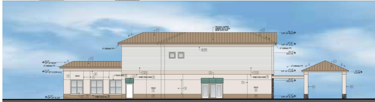
EAST ELEVATION SCALE: ONE INCH EQUALS EIGHT FEET