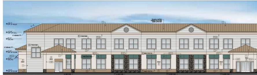
FRONT (NORTH) ELEVATION - PHASE 2 SCALE: SEE NEXT SHEET 1 FOOT