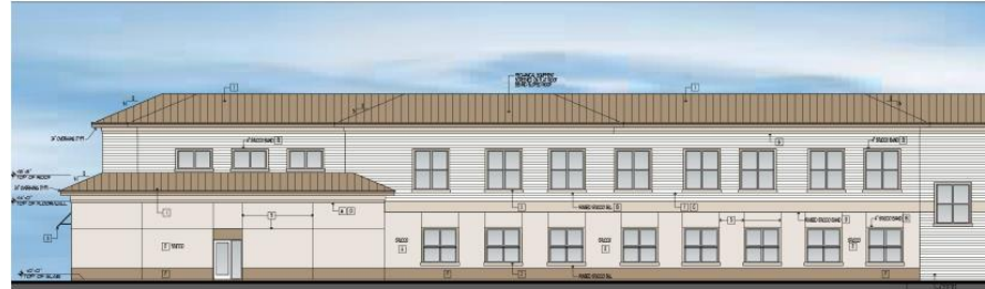
SOUTH ELEVATION - PHASE 1 SCALE: SEE NEXT SHEET 1 FOOT