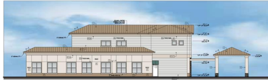
EAST ELEVATION SCALE: SEE NEXT SHEET 1 FOOT