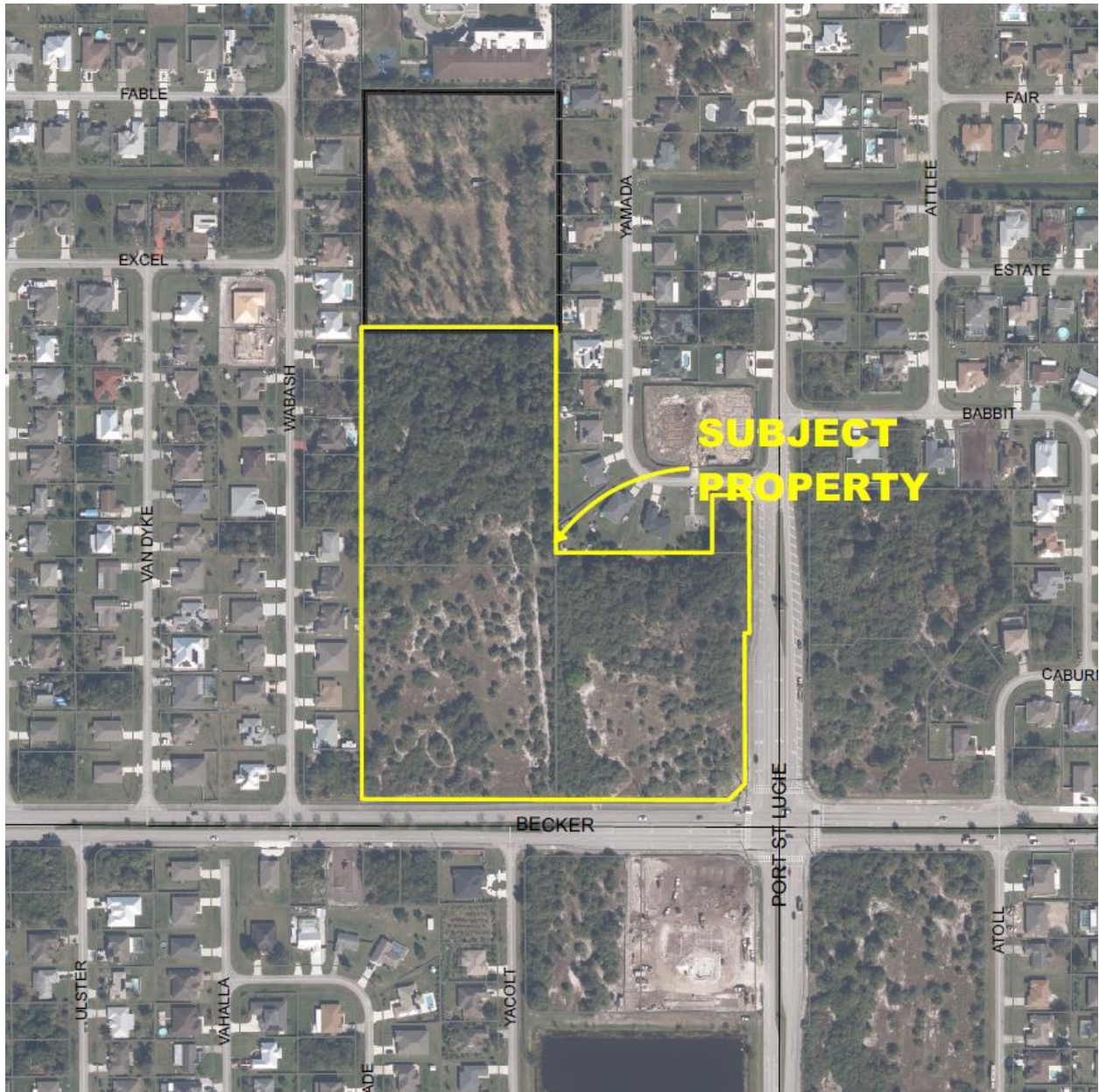
Project Aerial Map