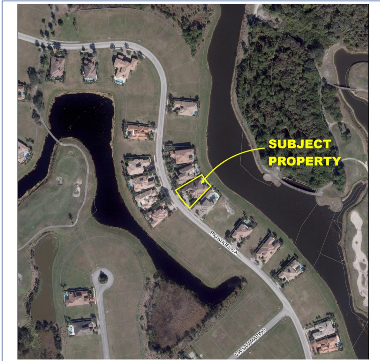
Project Aerial Map