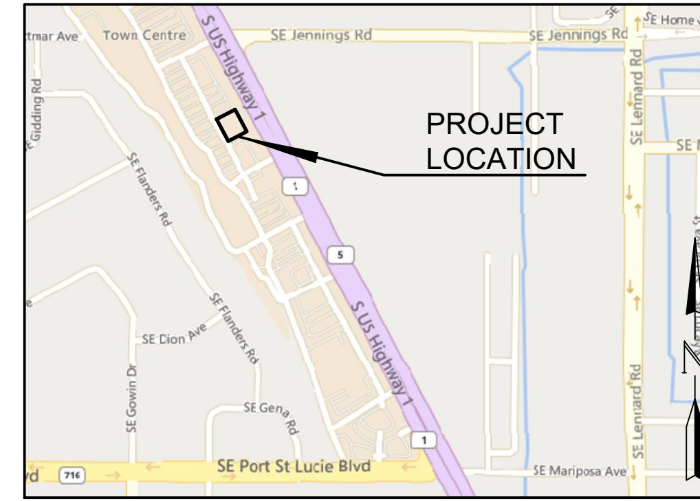
LOCATION MAP (INTENDED DISPLAY SCALE: 1"=800')