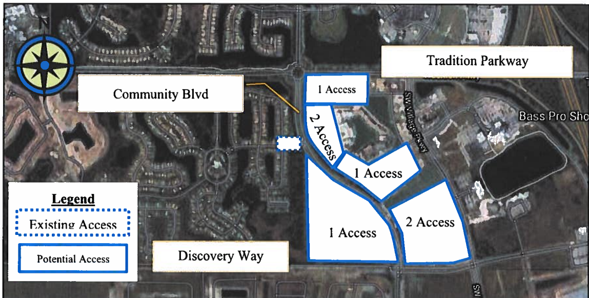
Figure 2. Existing and Potential Driveway Access