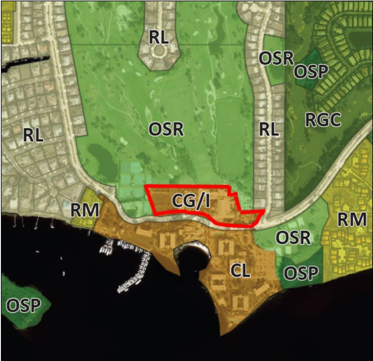
Proposed Land Use Map