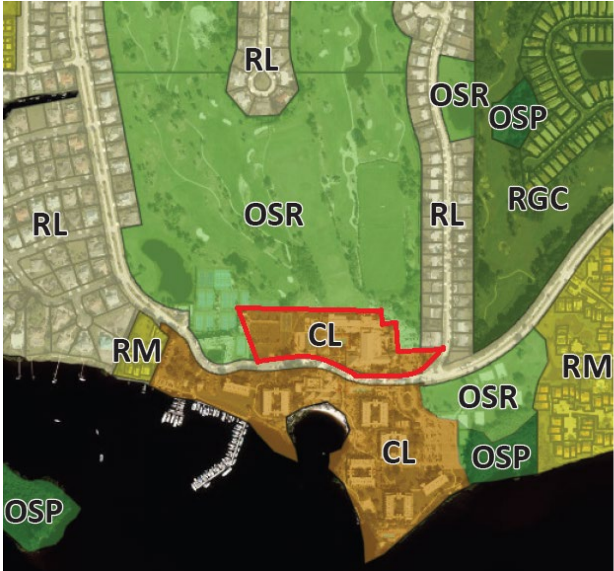
Existing Land Use Map